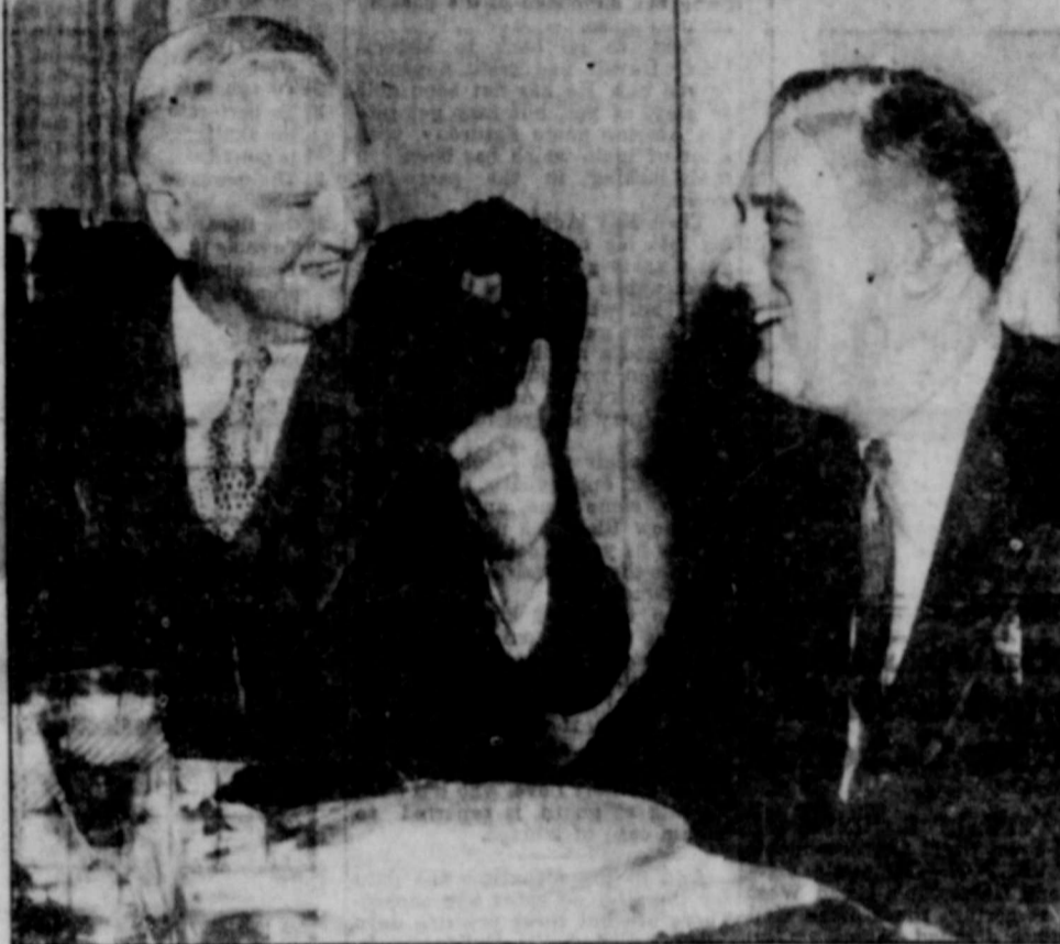
Maybe it's a campaign verse for the famous song that this "Frankie and Johnny" are smiling over, but nobody will ever know, because it wasn't a song camera that took this picture. Anyway, you see Franklin D. Roosevelt, right, as he listened, in happy mood, to something that John N. Garner, his running mate, told him when Garner visited Governor Roosevelt in Albany recently.