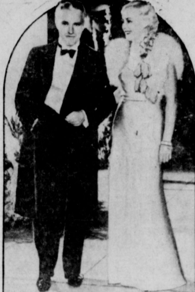
Smiling at persistent rumors that they soon will be married, and laughing aloud at reports that they already have been wed, Charles Chaplin and Paulette Goddard are seen together in Hollywood with increasing frequency. Here they are as they appeared at a recent movie first night. Chaplin neither confirms nor denies the reports that the platinum blond will be his third bride. Miss Goddard, recent divorcee, tells questioners she is "more interested in my movie work."