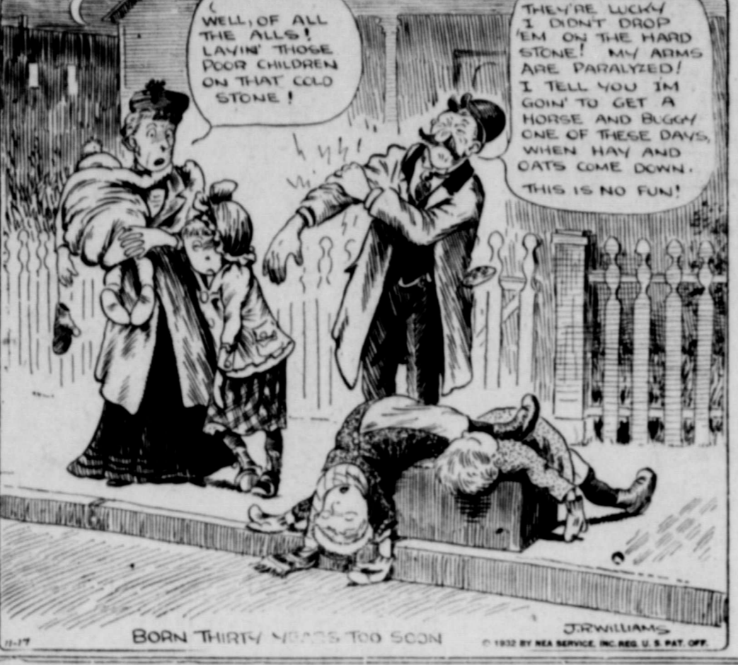
BORN THIRTY YEARS TOO SOON