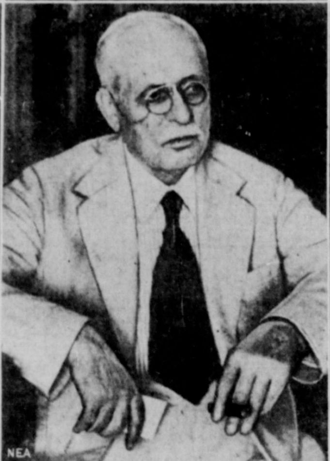
Camera-shy, Samuel Insull, Sr., former Chicago financier now sought on embezzlement charges in connection with the collapse of the gigantic utility empire which he headed, led photographers a merry chase in Athens, Greece, before finally consenting to pose for this photograph.