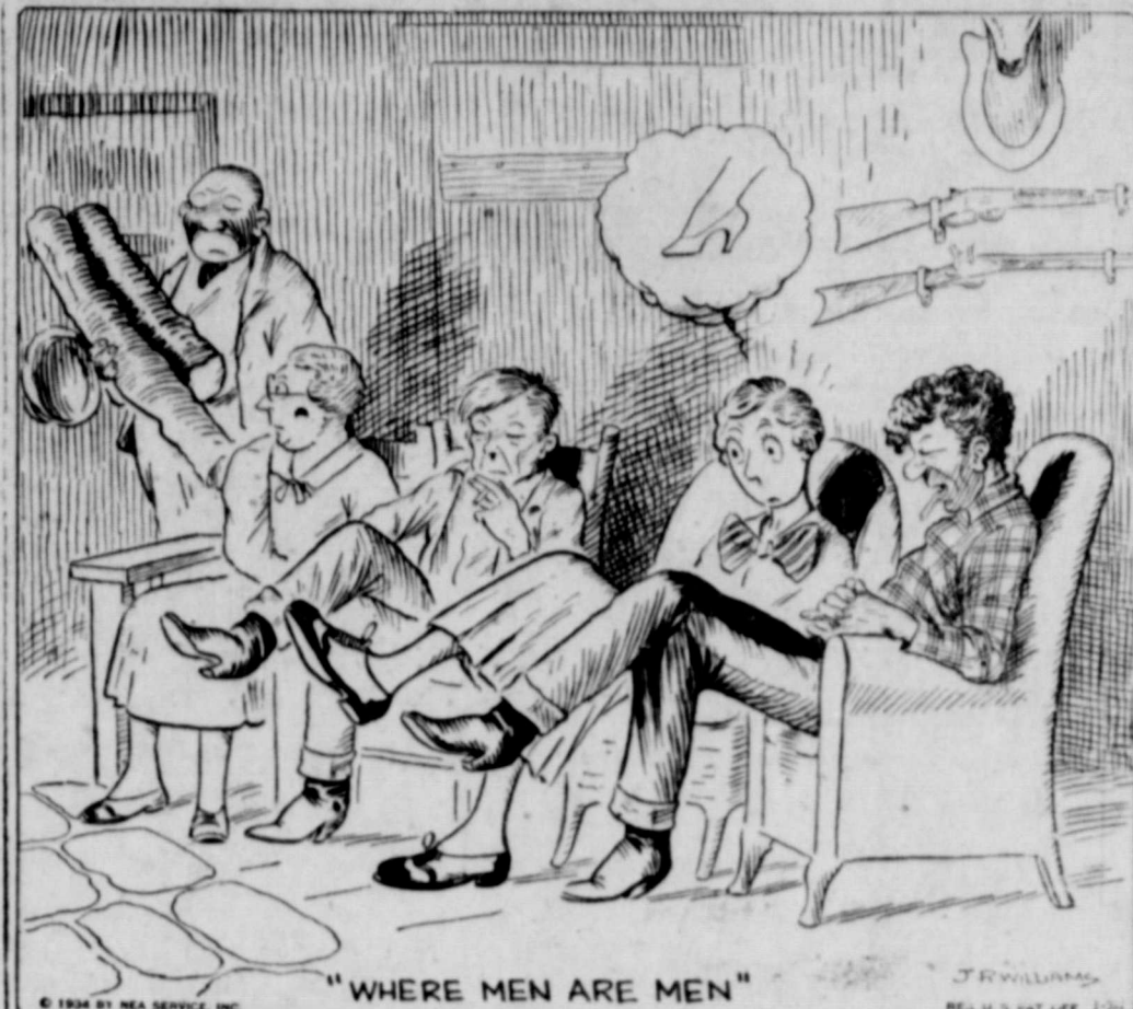
"WHERE MEN ARE MEN"