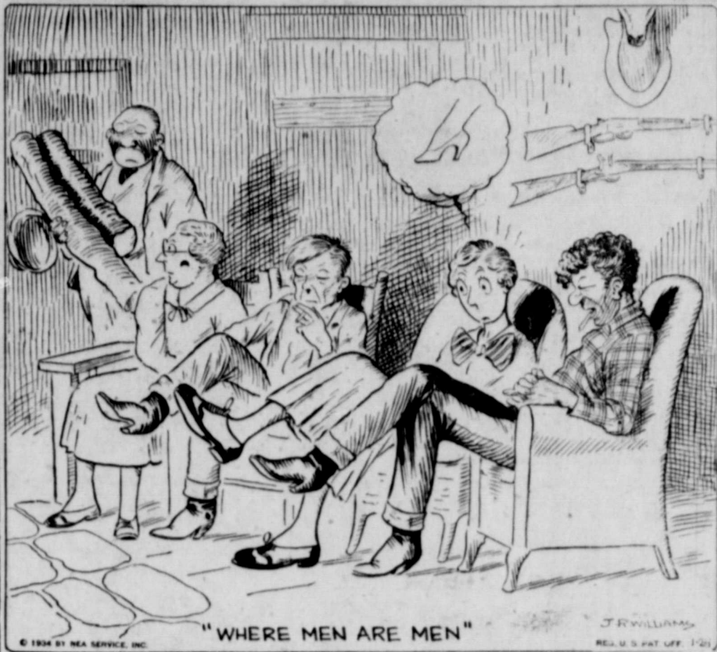
"WHERE MEN ARE MEN"