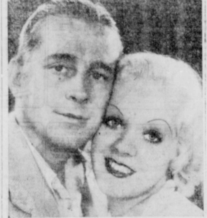
James Dunn and Alice Faye furnish the romance in Fox Film's fast and furious farce-comedy, "365 Nights in Hollywood," which follows the adventures of a blonde, young hopeful from Peoria and a smart-cracking director who get embroiled with one of Hollywood's fake movie academics.