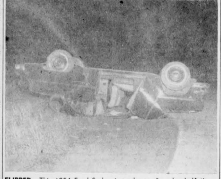
FLIPPED —This 1954 Ford Sedan turned over 2 and a half times early Sunday morning near Hart as its occupants were returning to Olton following the Rodeo in Dimmitt. See story below.