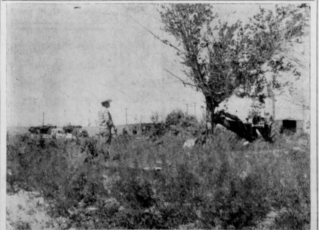
CITY OF DIMMITT workmen are shown here taking the first steps toward construction of a new city hall at Southeast Second and Jones. They are removing the elm trees from the quarter-block site. Bids will be opened late this month and construction should be well under way by the middle of the summer. A calculated guess is that the new city hall will be completed in November or December.