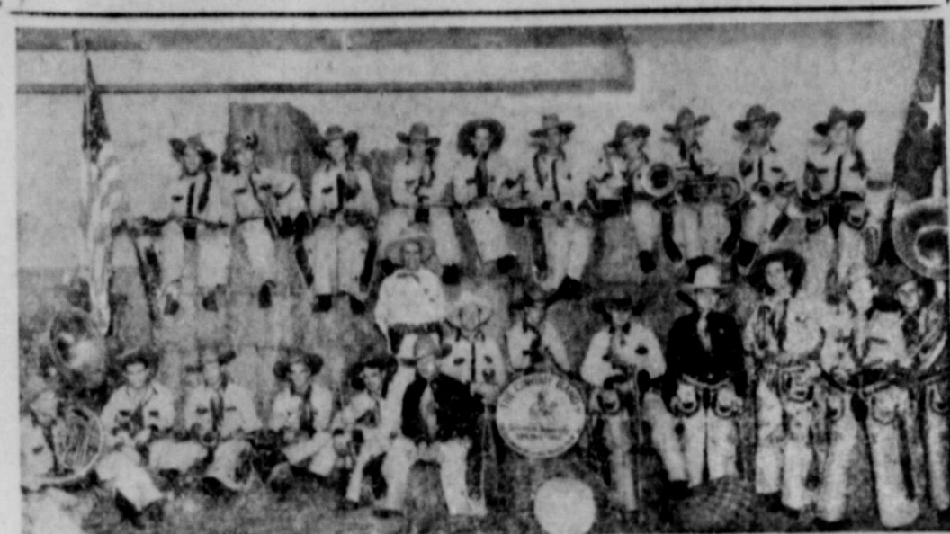
The internationally famous Cowboy Band of Hardin-Simmons University leaves Abilene June 16th over the Texas and Pacific Railway enroute to New York where they embark for Europe. A large party of loyal Texans will accompany the band.