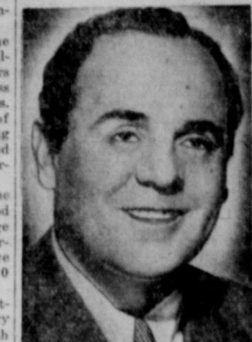
Leo Carrillo Star of "Winning Ticket" today at the Arcadia.