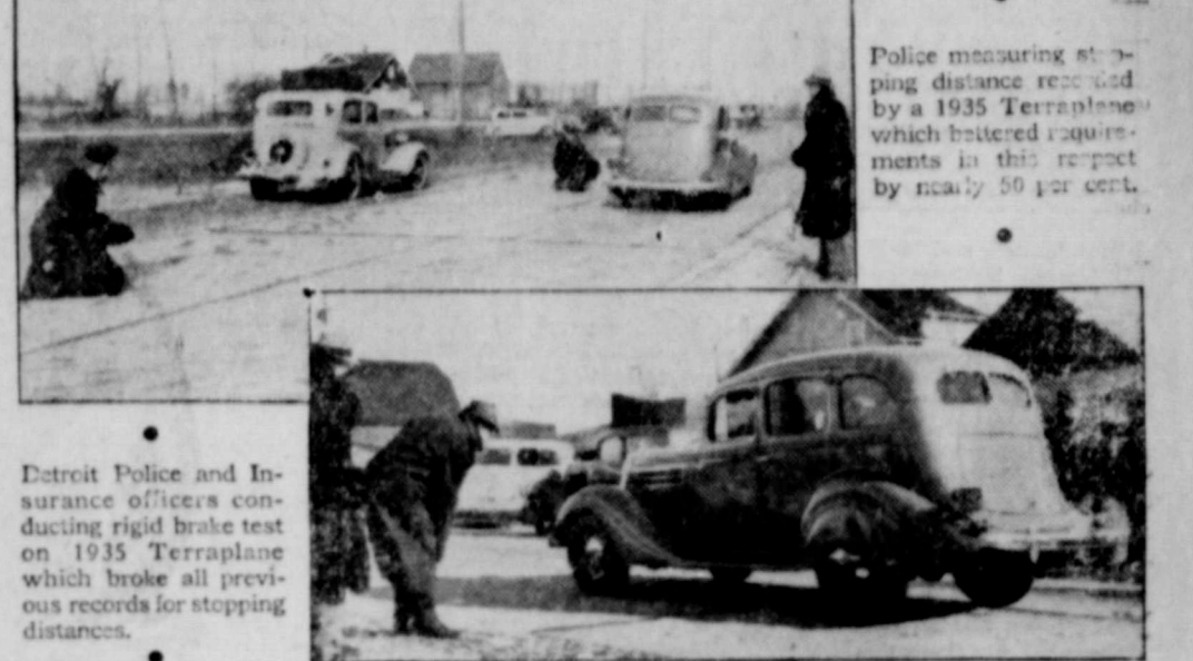
Detroit Police and Insurance officers conducting rigid brake test on 1935 Terraplane which broke all previous records for stopping distances.

Insurance and police officers of the City of Detroit recently conducted a brake test on a 1935 Terraplane Sedan. The purpose of the test was to compare the ability of this new model to stop with the standard cars approved by the Police Department at various speeds.