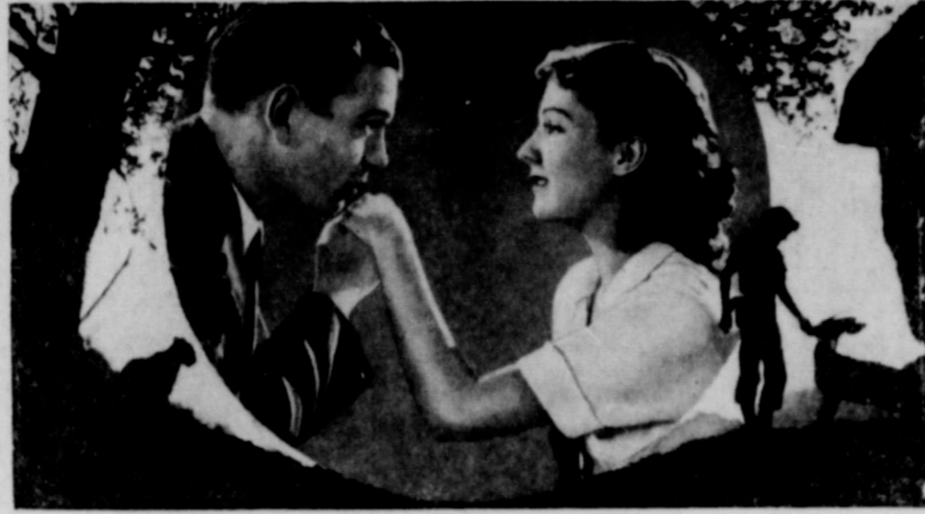
Russell Hardie and Jean Parker in "Squanto"