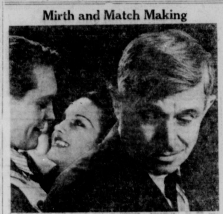
Rochelle Hudson and Richard Cromwell find the path of true love thorny in the new Will Rogers Fox Film comedy, where America's ace humorist tries his hand at match-and-mirth-making. Showing Saturday and Sunday at the Arcadia Theatre.