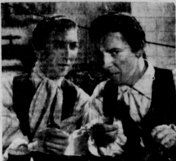
Francis Lister and Ronald Colman in "Clive of India" coming to the Arcadia Theatre next Monday and Tuesday.