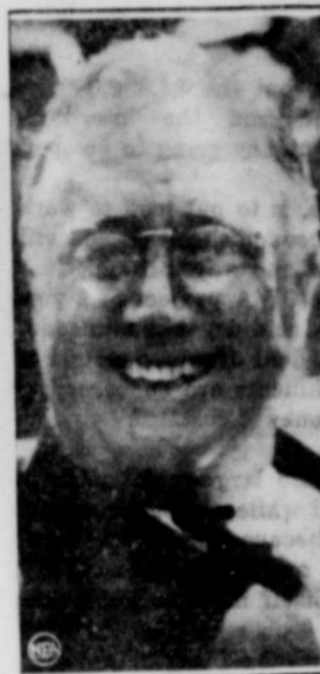
Coats of gas will be good this spring, judging by the sun-bronzed complexion and warm smile that President Roosevelt brought back to Washington after his tropical Sothwest expedition off Florida.

STRESA, Italy, April 13.—Great Britain, France and Italy have agreed to pursue a common policy for maintenance of European peace and inviolability of treaties, it was said today.