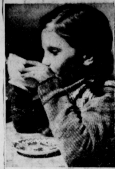
Small refugee finds food and comfort in a new home provided for her by a member agency of the National War Fund.

The Axis stops at nothing—Don't stop at 10%. Buy More War Bonds For Freedom's Sake