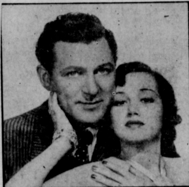
Carl Brisson and Arline Judge make a romantic pair in the leading roles of the Paramount comedy, with music, "Ship Cafe," uproarious fun film of a singing ship stoker's career as a bouncer and a gigolo. Robert Florey directed, showing at the Arcadia Theatre Friday only.