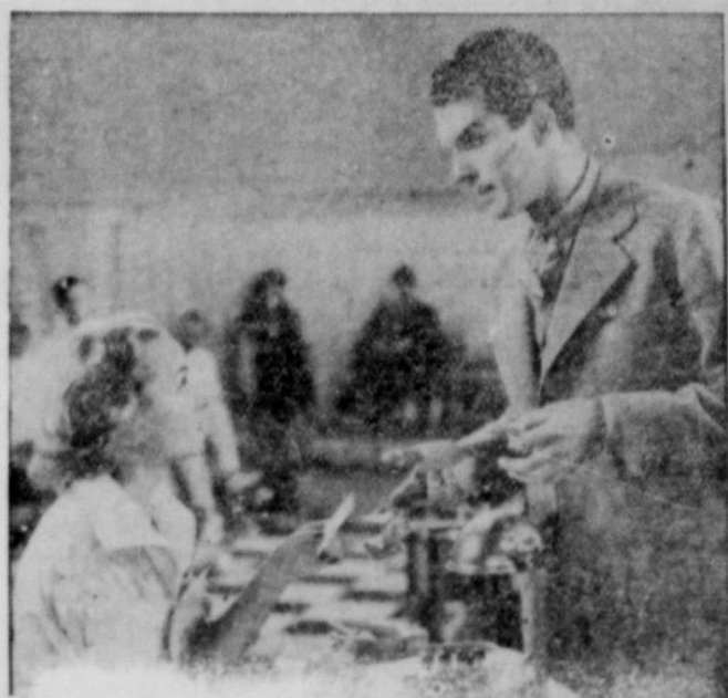
Carole Lombard and Fred MacMurray in "Hands Across the Table" playing Saturday only at the Arcadia Theatre.

FREE! NEW McCALL STYLE NEWS Ask For Yours At JOSEPH DRY GOODS Co. Ranger's Foremost Dept. Store 208-10 Main Street Ranger