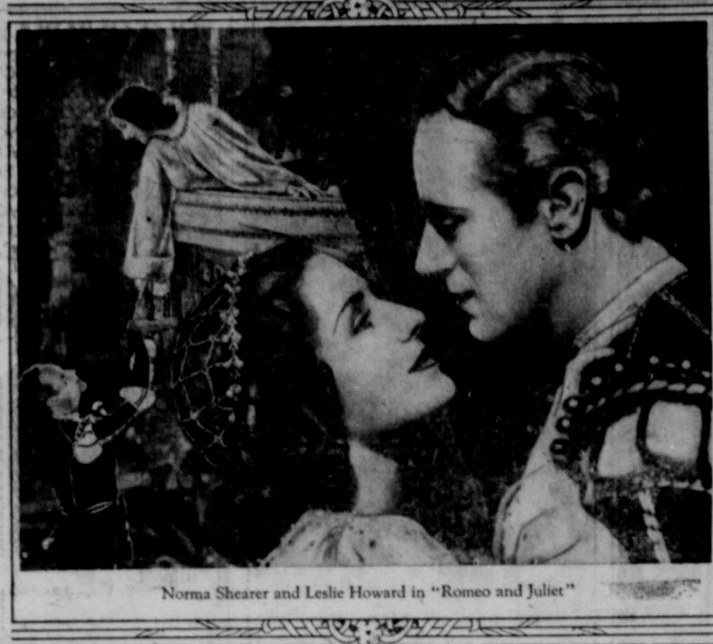
Norma Shearer and Leslie Howard in "Romeo and Juliet"