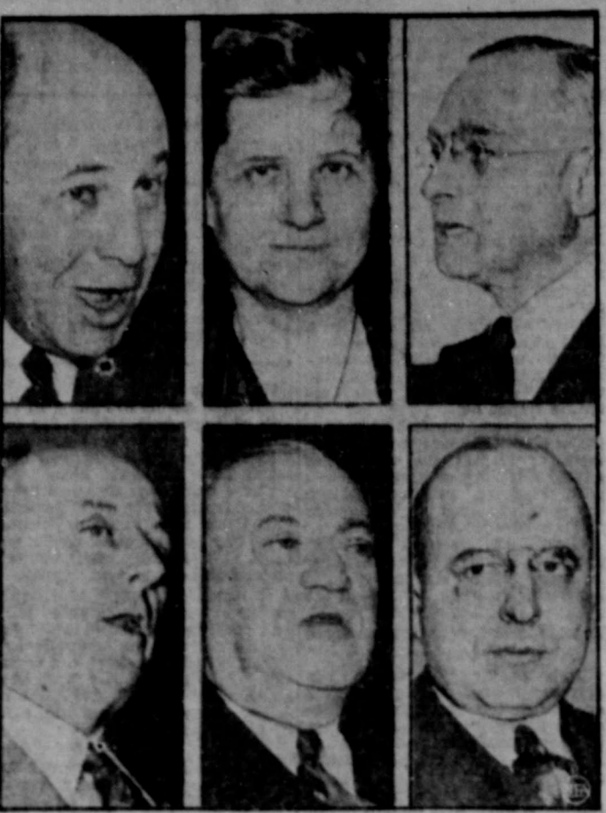
Among those mentioned as possible appointees to the supreme court in the event President Roosevelt's court enlargement program becomes law...