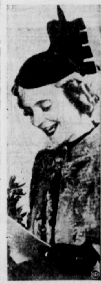
Women's hats are zany—even in Albania. Queen Geraldine, wearing something that looks like it fell off the back end of a windmill, is pictured dedicating a radio station in Tirana.