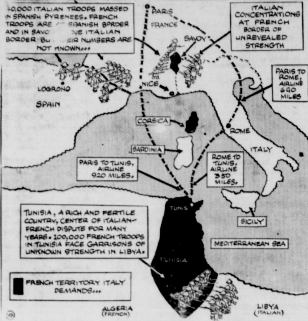
Map shows troop concentrations in Europe and Africa as Italo-French controversy gets hotter. Italian wants back one-third possessions now held by France.