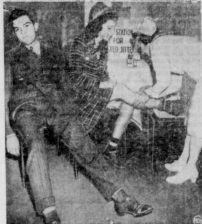
They don't quit until and when they do it's usually only for a few repairs. This pair of swingers are getting patched up in a first aid station of a New York night club.