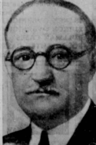
F. Donald Coster, president of McKesson & Robbins, who committed suicide following his arrest after $18,000,000 of the company's assets were discovered missing. Coster, whose real name was Philip Musica, was implicated in a million dollar swindle two decades ago.