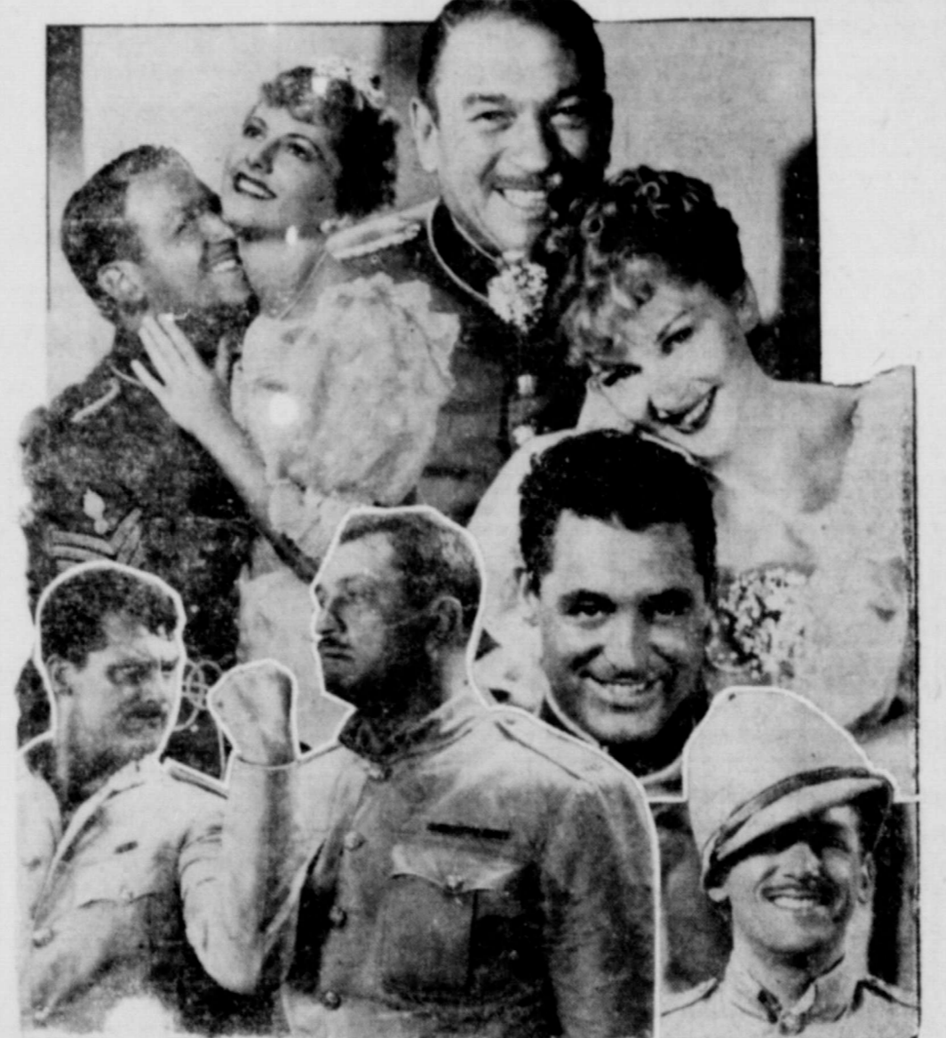
above are scenes from Rudyard Kipling's "Gunga Din," an RKO production featuring Carey Grant, Douglas Fairbanks, Jr., Victor McLaglen and Joan Fontaine, which will be the attraction at the Arcadia theatre starting today.

STUDENTS CURB JITTERBUGS TOLEDO, O.—Reform has struck the students at the University of Toledo and, according to the students themselves, it's fun. Jitterbugs, strong drink and updo hair dresses are taboo at El Aboodo, new student night club, operated by students for students.