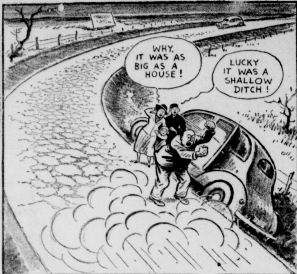
The Chant of a Texas Taxpayer When a Super-Colossal Truck Passed His Way