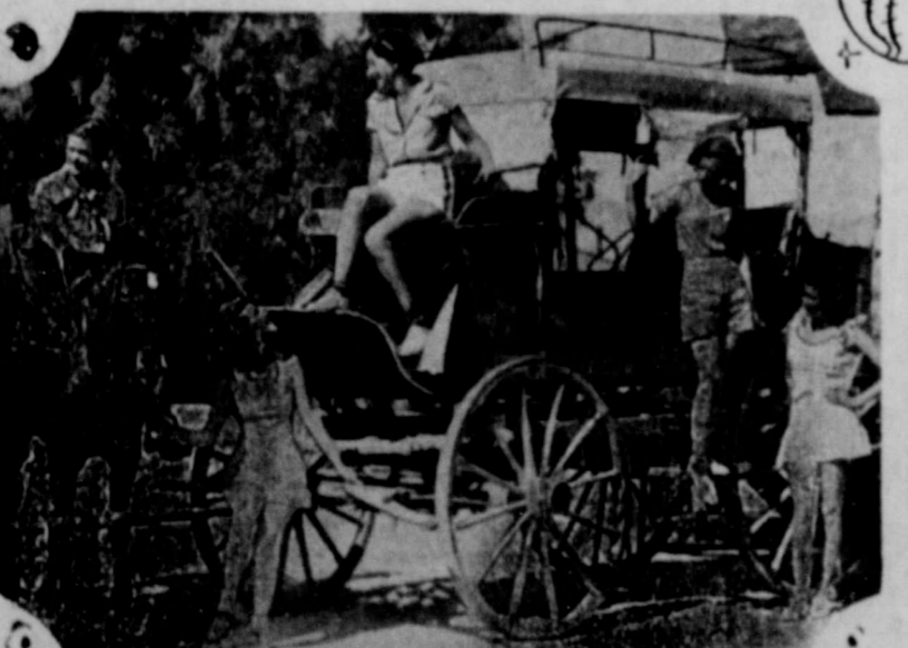
Dude ranching has sent cowmen hunting for antiques of the Old West. . . This ancient stagecoach hauls dudes.

The trouble with the dude ranches is that the tophand can't teach an old cow pinto to be a circus horse. And he can't expect a buckaroo who's been to the best high school in Rattlesnake county to say "sit" for get, "uh" for to "yore" for you're, and to disregard his final "g's." It takes a little practice even for the bright young cowpunks recruited from Harvard or Yale to learn to say "loak a cayuse" instead of mount a horse, "part leather" for get thrown, and to pronounce corral "kah-rell," and doggie to rhyme with stogy.