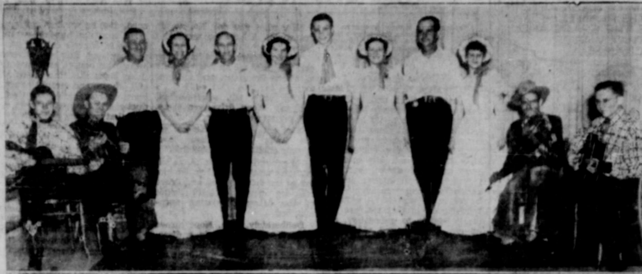
The Bluebonnet Square Dance Set of El Paso, acclaimed as national champion square dancers at the Southwestern Exposition and Fat Stock Show in Fort Worth last March, will be presented at the Recreation Building, Ranger, Saturday night, May 13, from 9 to midnight.