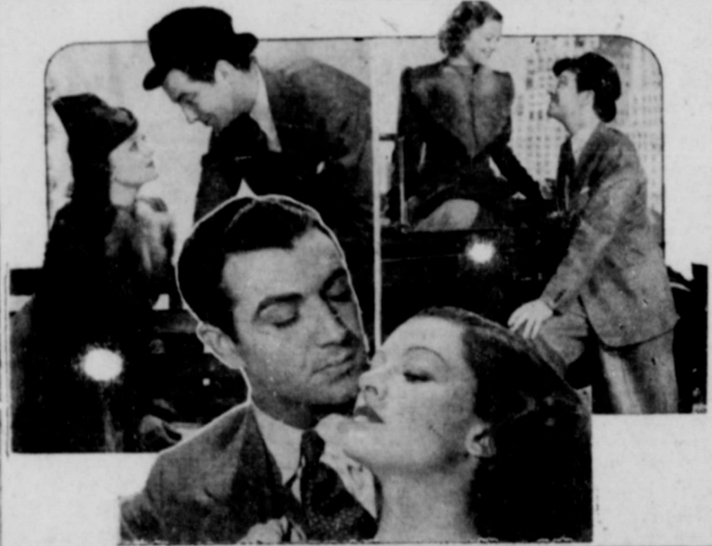
Robert Taylor and Myrna Loy in a scene from 'My Lucky Night', a forthcoming Metro-Goldwyn-Mayer picture which will be shown at the Arcadia theatre for two days starting today.