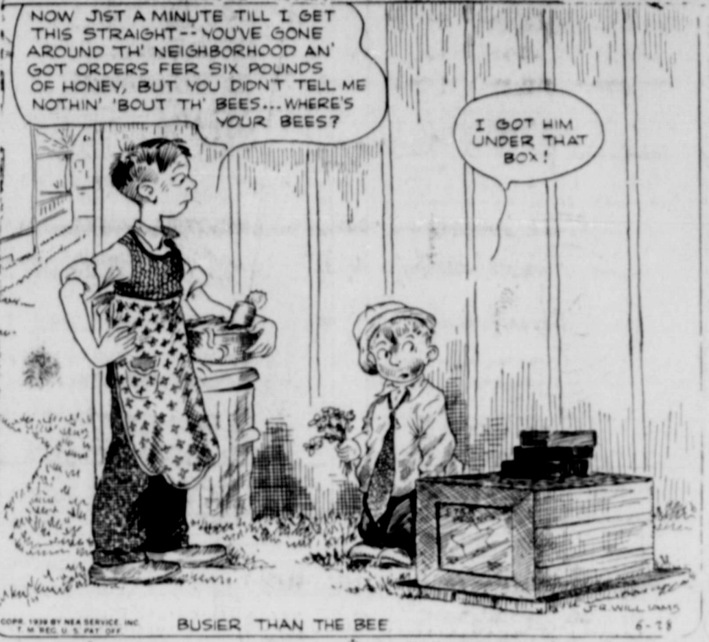
BUSIER THAN THE BEE