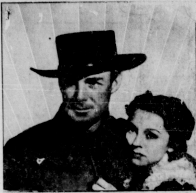
Randolph Scott and Nancy Kelly in a thrilling scene from "Frontier Marshal," 20th-CenturyFox production, currently at the Arcadia Theatre.