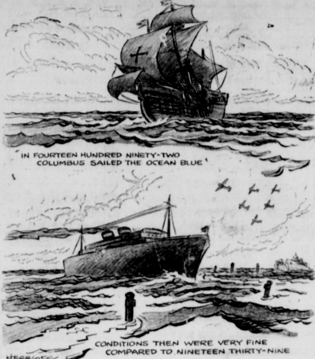
IN FOURTEEN HUNDRED NINETY-TWO COLUMBUS SAILED THE OCEAN BLUE CONDITIONS THEN WERE VERY FINE COMPARED TO NINETEEN THIRTY-NINE