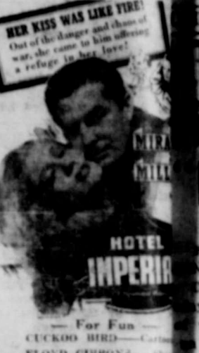
HER KISS WAS LIKE FIRE! Out of the danger and shame of war she came to him offering a refuge in her love!

For Fun... FLOYD GIBBONS... COMING TOMORROW... JOE E. BROWN MARTIN... 1000 A TOUCHDO