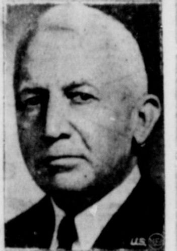
Mayor Gen. Lorenzo D. Gasser, above, is favored by Mayor F. H. La Guardia to take over the protective side of civilian defense after the latter resigns as OCD chief.