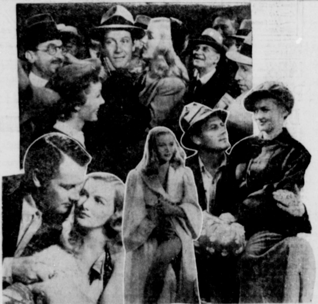
Action and comedy with a blonde beauty throughout is the blending that makes "Sullivan's Travels" a Paramount picture that will be seen at the Arcadia theatre here today...