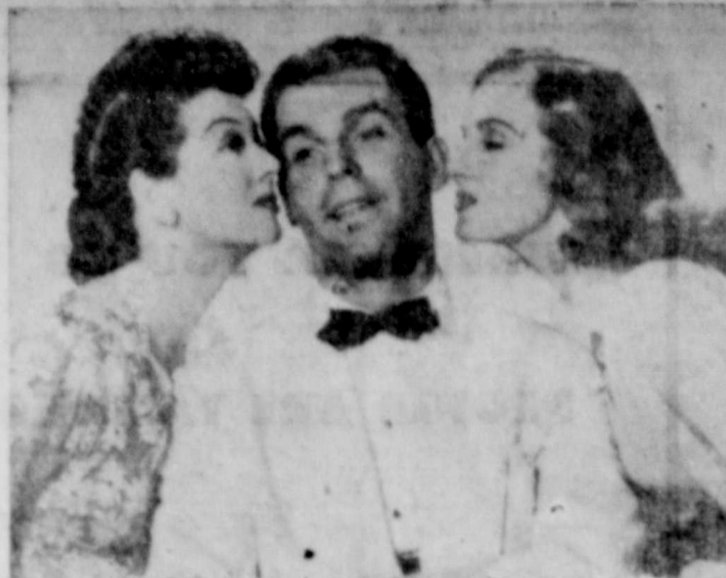
Rosalind Russell and Constance Moore swap nonchalant Fred MacMurray with kisses in "Take a Letter, Darling." The new comedy is at the Arcadia today and Sunday.