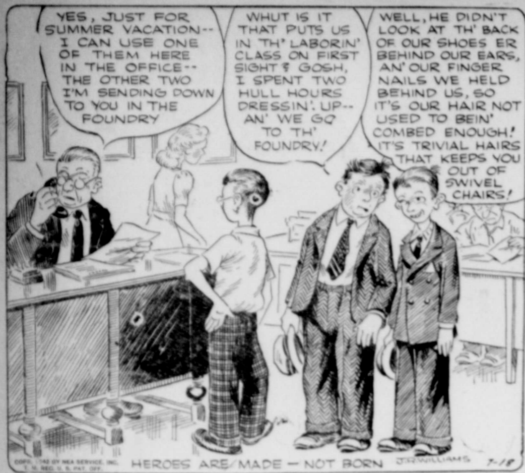
HEROES ARE MADE -- NOT BORN