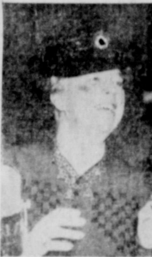
Mrs. Franklin D. Roosevelt urges women to save on "little things" to provide money for War Bonds and Stamps.