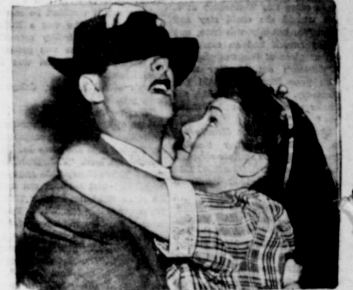
Robert Cummings fails to see the humor in Diana Barrymore's love making in their ri-roaringly funny picture "BETWEEN US GIRLS" Now showing at the Arcadia