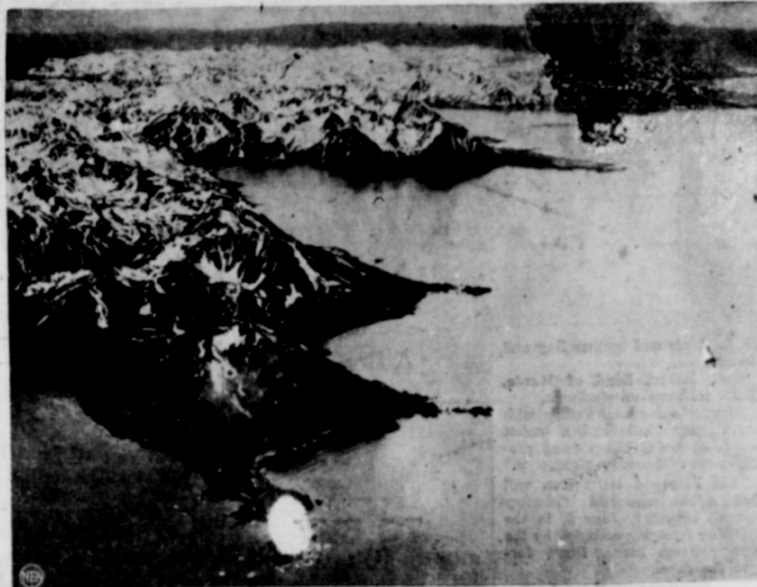
Here is rugged, mountainous Attu, scene of American forces' first offensive in the North Pacific. This airview looking eastward from Cape Wrangell shows the island's many inlets and the snow-capped volcanic hills that slant right down to the sea, leaving little fighting terrain.