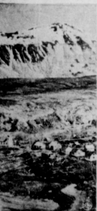
Attu village is a tiny cluster of wooden houses on Chichagof Harbor. Note Russian church at left.