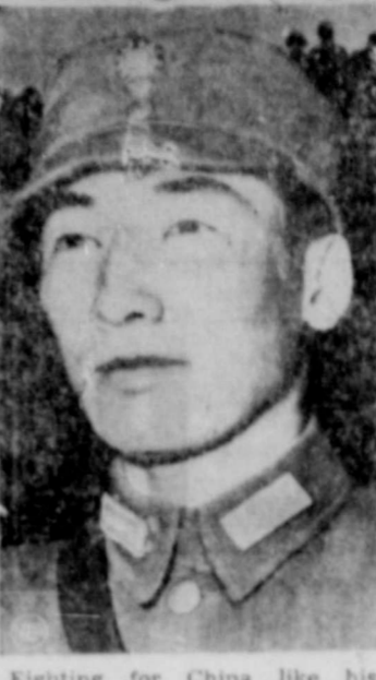
Fighting for China like his famed father is artillery Capt. Chiang Wei-kuo, youngest son of the generalissimo.