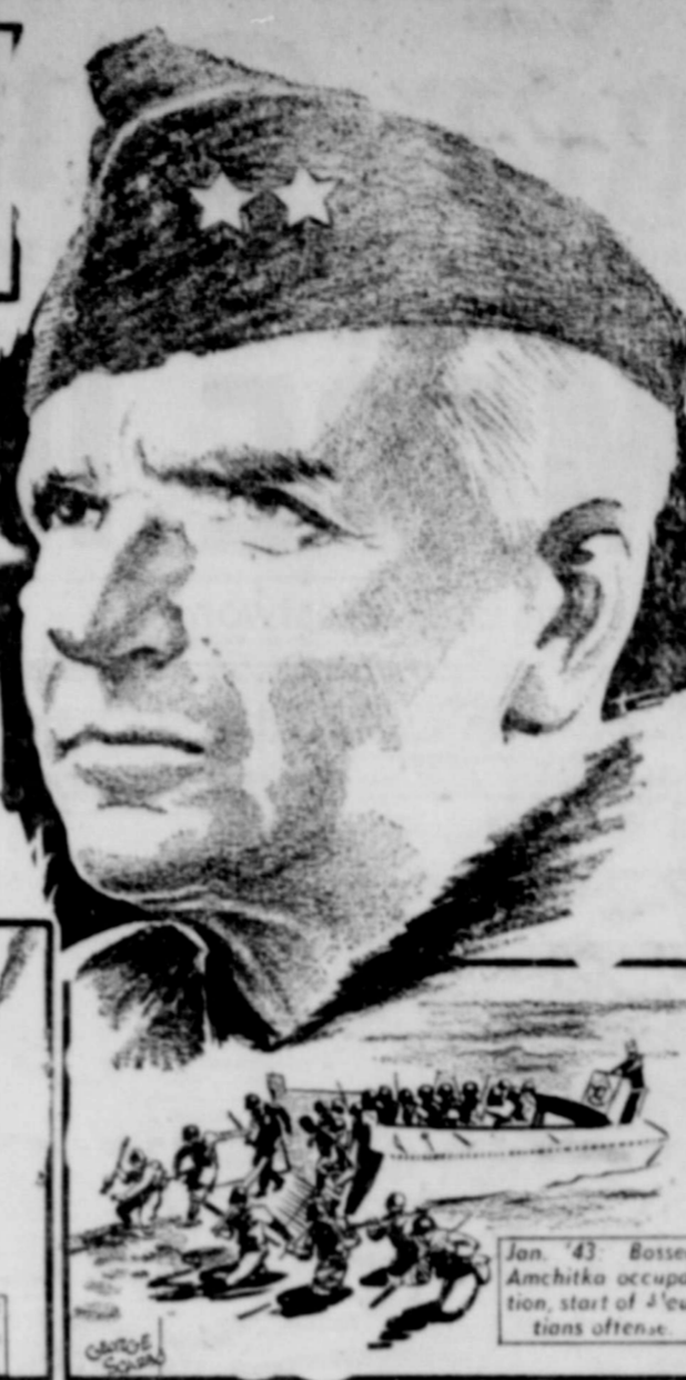
Jan. '43. Bossed Amchitka occupation, start of Japanese offensive.

Following, barrel-built Maj. Gen. Simon Bolivar Buckner is the big boss of our Alaska-based offensive in the Aleutians. Alaska is one-fifth the size of the U. S., but it has more shoreline—every foot watched under Buckner's direction.