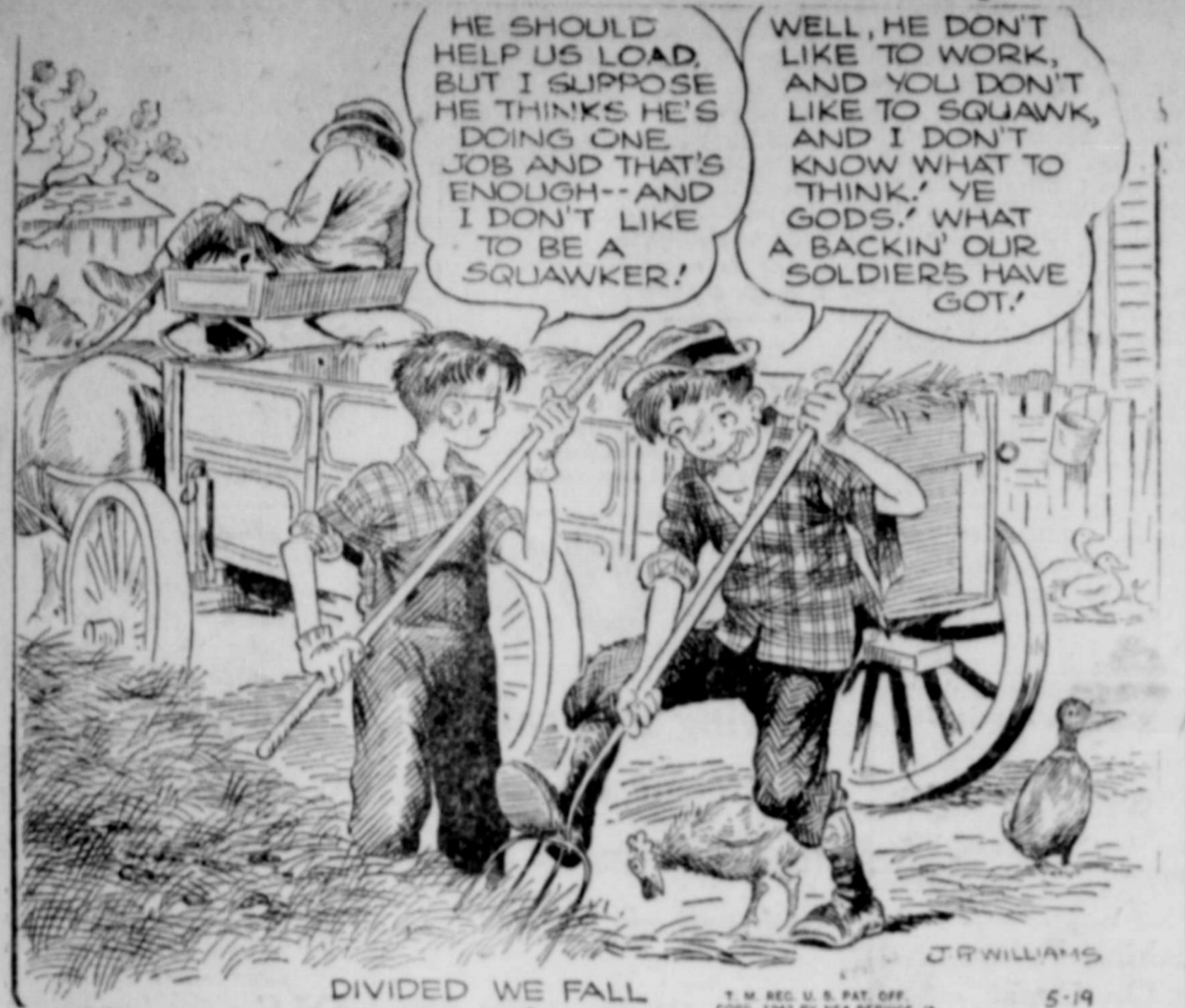
DIVIDED WE FALL