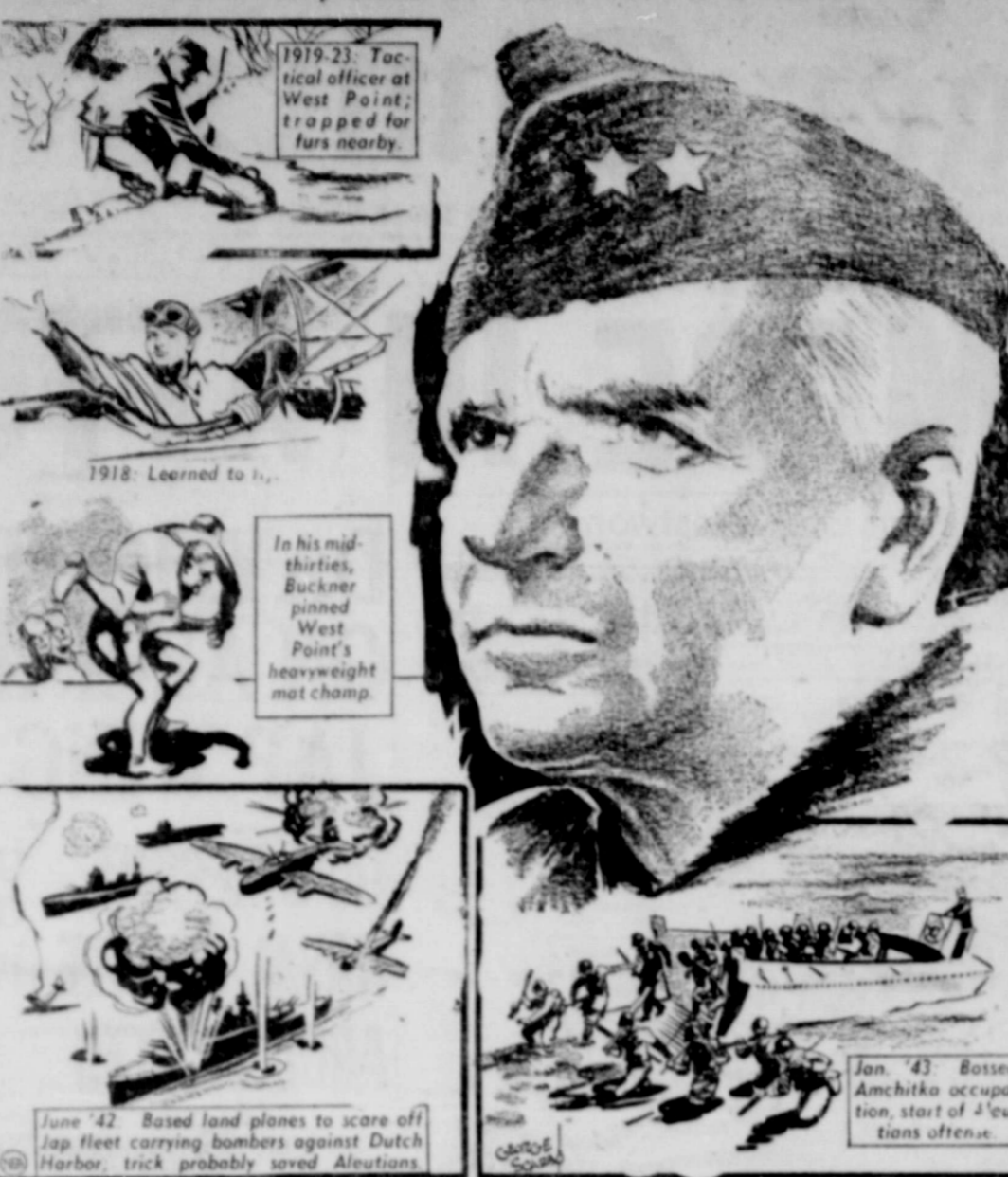
1919-23. Tactical officer at West Point; trapped for furs nearby.