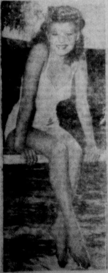
Miss America beauty queen title, will soon be seen on the screen. She has a movie contract.