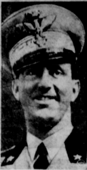
Likely successor to King Victor Emmanuel if he quits Italy's throne is his son, Crown Prince Umberto, above.

with one-half cup of sugar to one cup of juice.