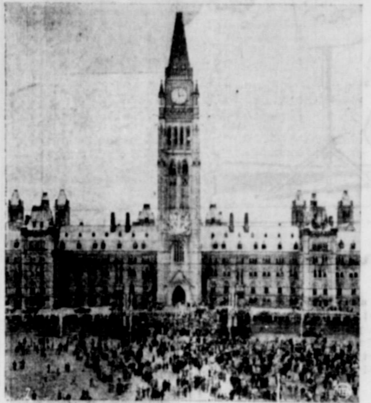
This is the Parliament Building in Ottawa, capital of Canada, where President Roosevelt made an open air address to the Canadian legislators. He spoke from the front steps of the building.