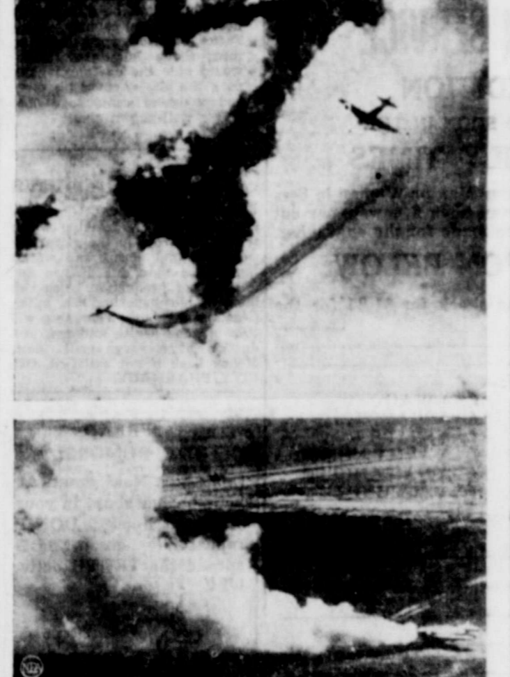
In one of the few photos showing air action by Soviet forces a Russian plane is seen, top right, as it dives down on a Messerschmitt 109 over the Kuban river front. The flaming Nazi craft crashed in a cloud of smoke—the 10th enemy plane shot down by Soviet ace Capt. Ivan Torosov.