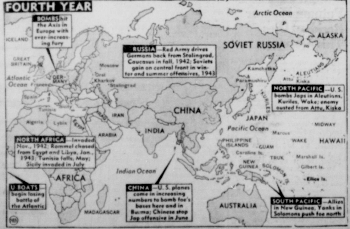
Here is the history of four years of war at it spread from Poland's frontiers to encompass the whole world. Highlights of conflict for each year are summed up in maps tracing courses of 1939-43 conflict.