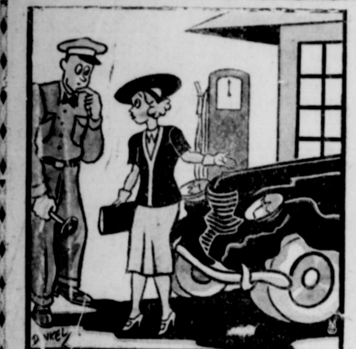
"Could you straighten it out by five o'clock? I don't want my husband to know. I took the car out today!"

Bring your Fender, Body & Mechanics work to us— Prompt and satisfactory service guaranteed.— Estimates cheerfully made on any kind of automobile repair—