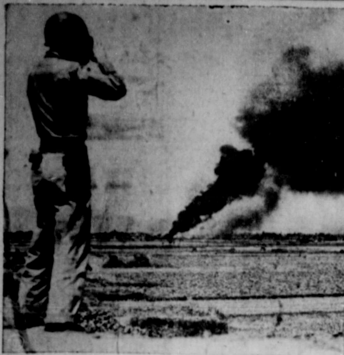
It cost the Japs 15 planes to set one of ours afire in a raid on an advanced American airfield somewhere in China. U. S. soldier watches a Liberator bomber go up in smoke after the enemy attackers caught it on the ground.