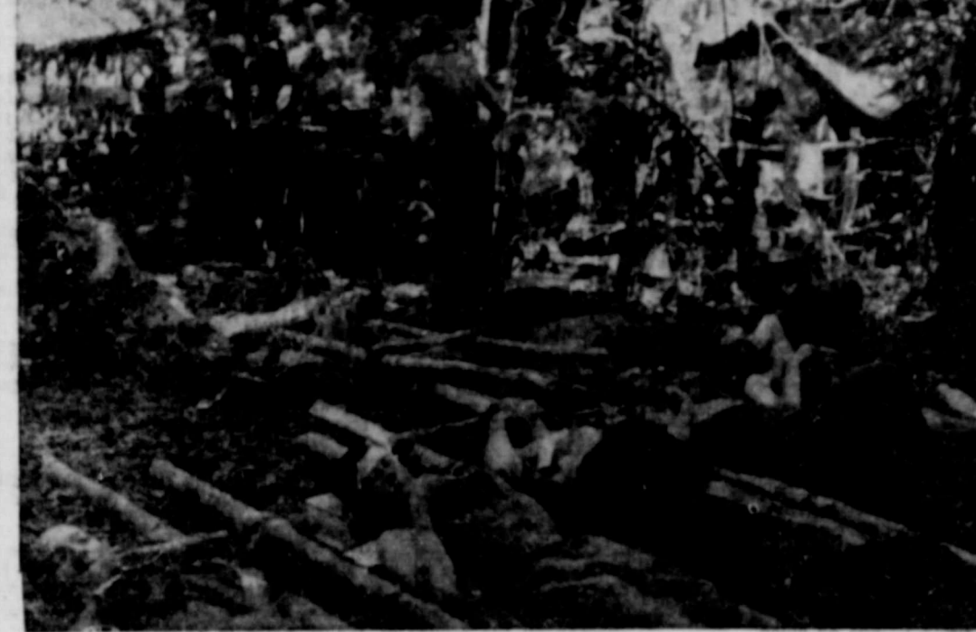
The hours are hot, and long and tedious as these wounded men wait to be evacuated. This is a "Portable Hospital" somewhere in New Guinea, consisting of a space cleared out of a thicket of palms and underbrush, and rows of hard, home-made stretchers. You owe it to these boys to Back the Attack of their buddies who are fighting now on other battlefronts. Buy that EXTRA $100 Bond in the Third War Loan.