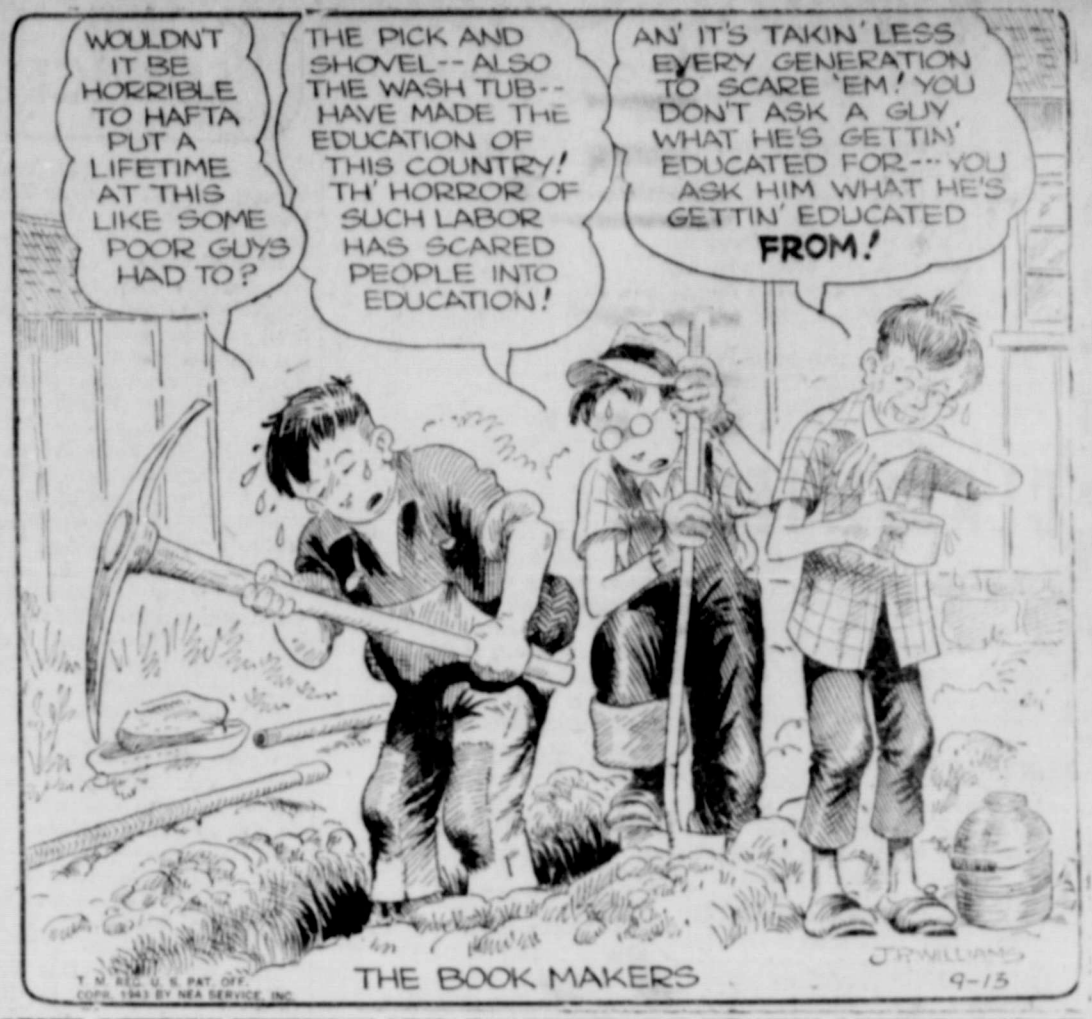
Gobs of Action