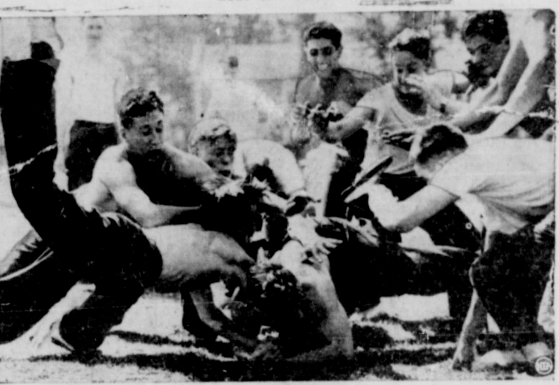
Soccer takes on an unusually strenuous aspect as it is played at Great Lakes Naval Training Station. Sometimes there are as many as 50 on a side, but otherwise rules are observed except when it gets a bit rough. Then the boys frequently behave as though they were giving the Japs the full treatment.

Officers Must Pay If Dog Tag Missing STUTTGART, Ark. (UP) — When two army officers meet at the Stuttgart Army Air Field, a bystander is apt to hear a conversation like this: "Good evening Captain." "Good evening lieutenant." They proceed in different directions approximately ten feet, when the captain turns as though he has just remembered something. "Lieutenant, let me see your dog tags." "Dog tags, sir? Oh yes, dog tags, identification tags, yes, yes indeed, have them right here. (Frantic search from chin to abdomen.) "Good idea, dog tags, never can tell, I always say sir, I regret to say sir, that there are no dog tags on this body." "The usual fine, Lieutenant, if you will settle the account now." The lieutenant digs into his pocket unhappily and extracts 25 cents. "This is the correct amount, I believe, sir." In case a wrong impression may be given, it is not just the captains and the lieutenants who have to obey this regulation. It applies to all officers on the field. And in case there are any GI's standing around laughing—they should be warned. They are probably next in line.