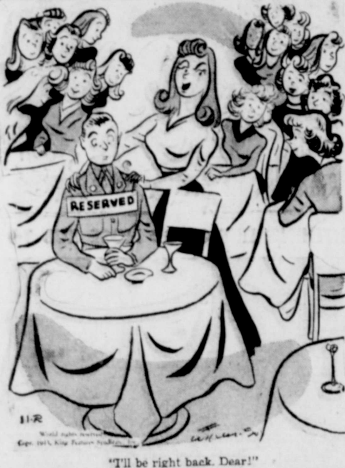
"I'll be right back, dear!"