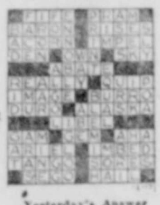
Yesterday's Answer: 36. Unadulterated, 38. Likely

CRYPTOQUOTE—A cryptogram quotation KUTGDGH NGGFN LTH IHOU NUTOES WG TL CT XTOCINE—DTEIMANG.