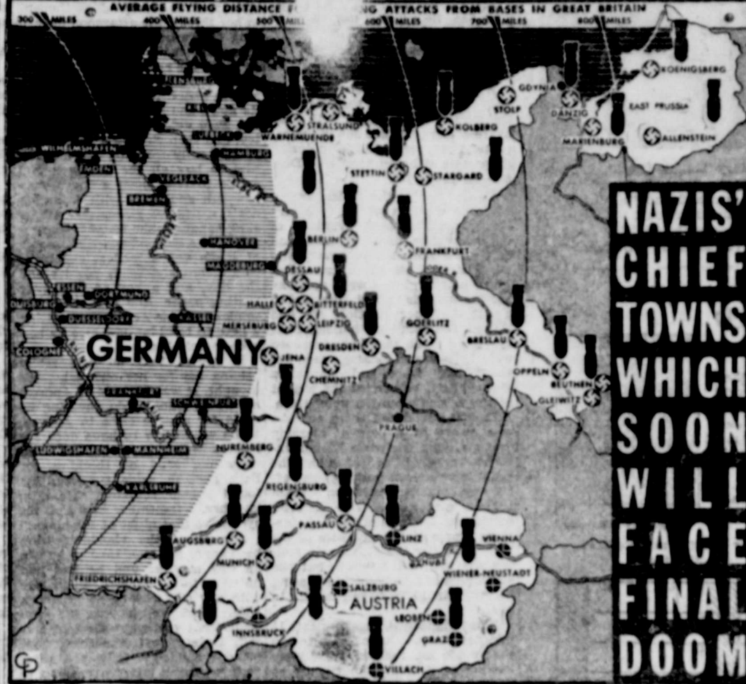
"NO POWER ON EARTH can prevent the destruction of the German Armies... and their war plants from the air," read the proclamation of the Big Three at the Teheran conference.

Enough Rotensone has been purchased by the livestock men to treat 1,375 head of "grubby" animals.