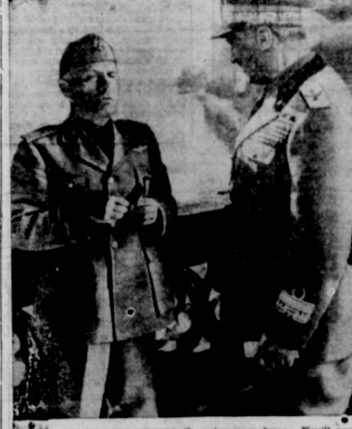
When NAZIS PULL THE STRINGS, these two men jump. You'll probably recognize Italy's ex-Duce, Benito Mussolini, left, who now heads what is called the Republican-Fascist government of Italy.