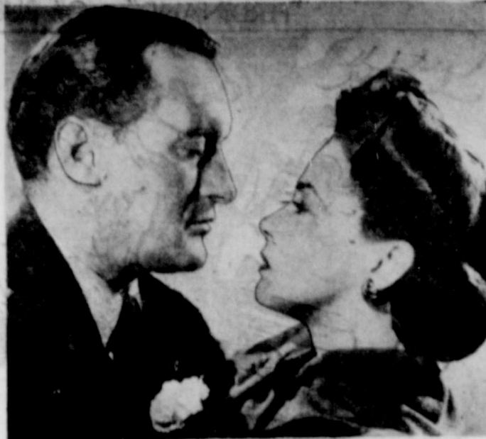
George Sanders and Marguerite Chapman in a romantic scene from the Columbia picture, "Appointment in Berlin," with Gale Sondergaard