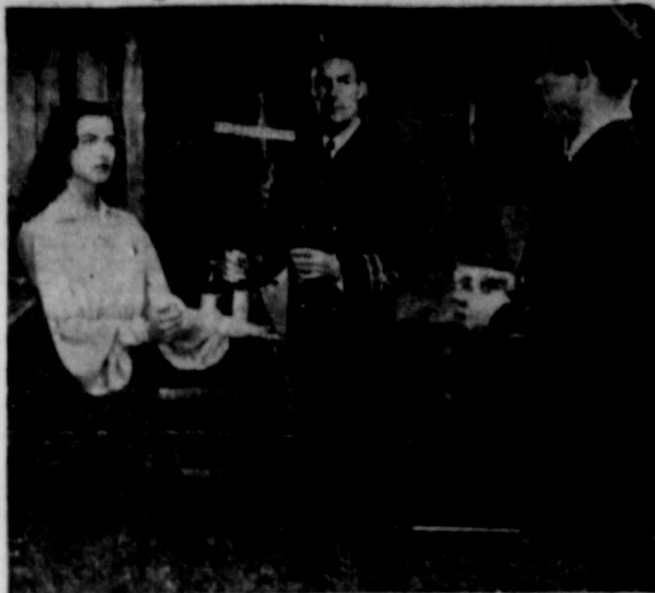
Ella Raines, Randolph Scott and James Brown in a scene from Universal's action-packed drama of the Royal Canadian Navy, "Corvette K-225."