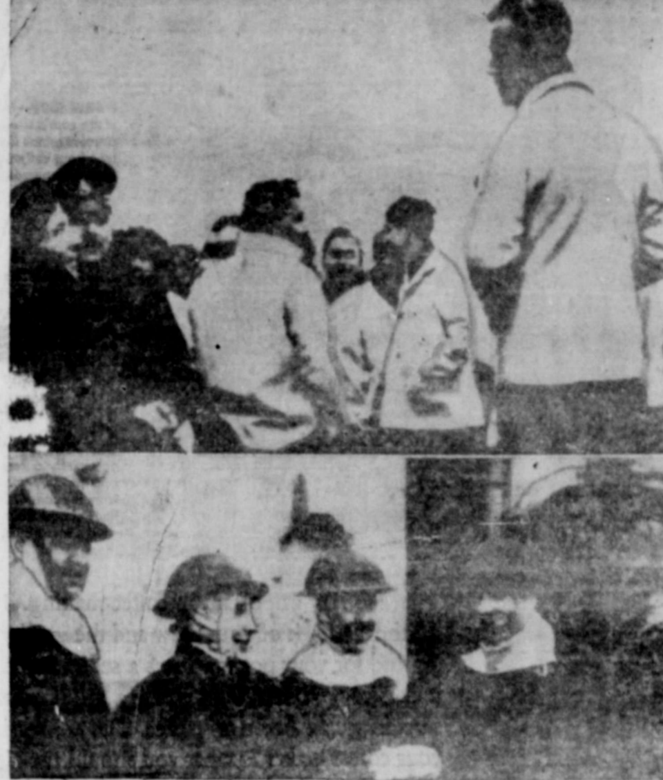
From London comes these radiophotos showing survivors, hatless, top, of the 6,000-ton German battleship Scharnhorst, sunk by the 35,000-ton Duke of York and a group of cruisers and destroyers off Norway's north Cape and below, the men who dealt the death blow. Final torpedo attack which completed the Scharnhorst's destruction was fired by the British cruiser Jamaica. Five torpedoes who fired the final torpedoes into the Nazi warship are pictured on the Jamaica in the photo below.