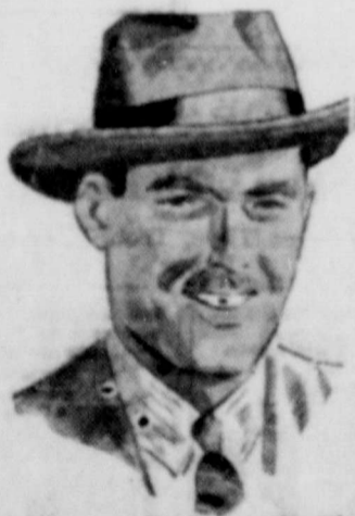
Left . . . jaunty welt edge hat . . . smooth suede finish . . . dual role hat . . . for business or sports.