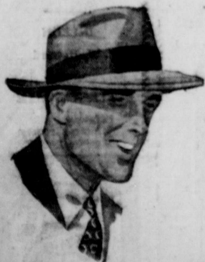
Right . . . Thin trim, smart crease hat . . . up-or-down brim . . . holds its shape . . . has serviceability.