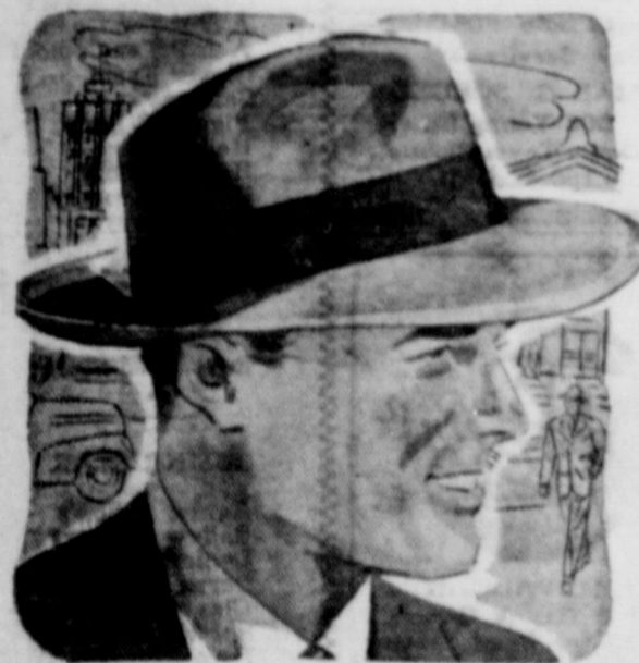
Above—lightweight felt hat wide ribbon band . . . low crown . . . large snap brim . . . youthful.

Whether you are smooth or conventional, you'll find a "topper" to suit your taste. Lightweight Spring favorites, distinctive, yet casual, right for any time of day. Easy snap brims, ribbon or crepe bands, soft crowns, all stylish with durability a d d e d. New shades.