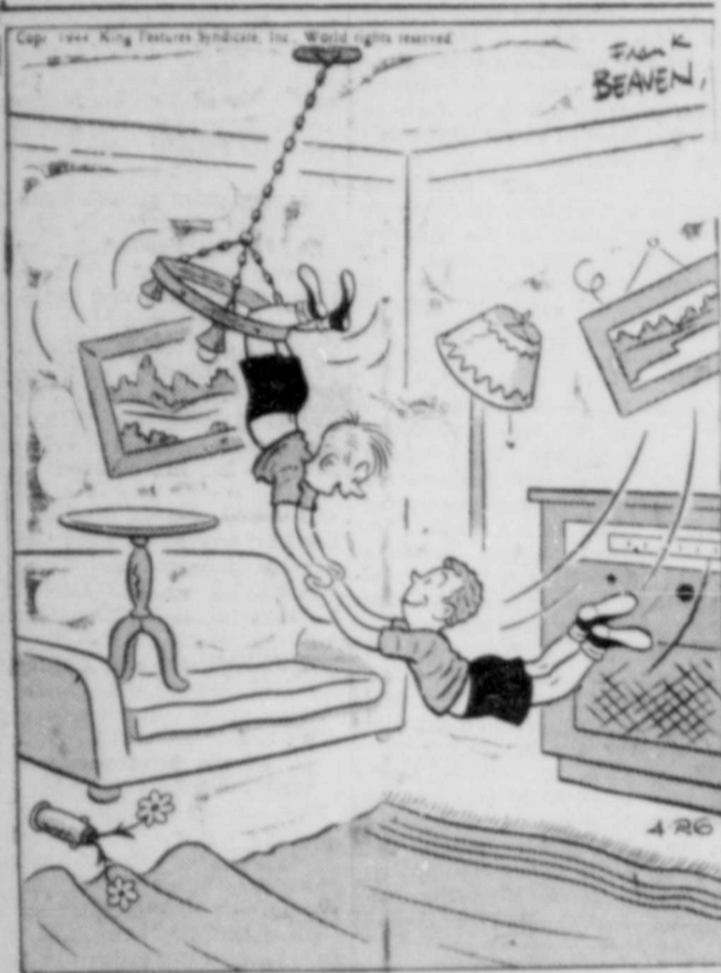
"Oh, Mom won't care. She's broadminded!"