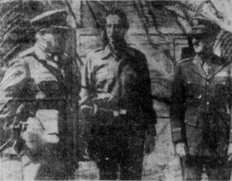
GEN. SIR HENRY MAITLAND WILSON, left, commander-in-chief of the Mediterranean area, and his deputy, Lieut. Gen. Jacob L. Devers, are shown visiting Fifth Army headquarters and the Fifth Army commander, Lieut. Gen. Mark W. Clark.