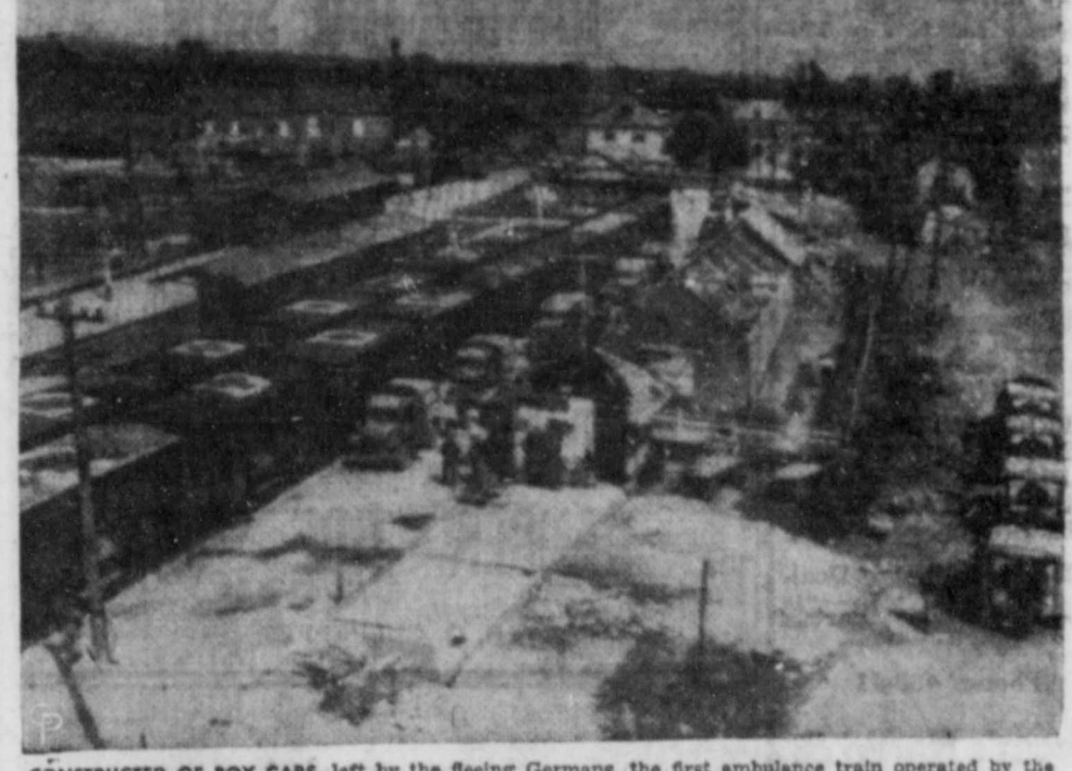
CONSTRUCTED OF BOX CARS, left by the fleeing Germans, the first ambulance train operated by the Allies in France is shown above being loaded at Lisca.