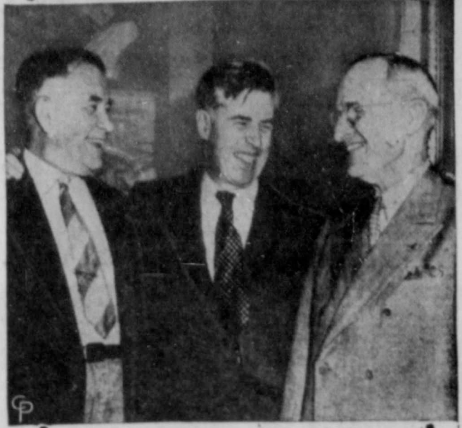
SENATOR HARRY S. TRUMAN of Missouri, who is the Democratic nominee for vice president of the United States, is shown on his return to Washington after a visit home. On hand to greet the candidate were Senator Alben Barkley, left, and Vice President Henry A. Wallace, whom he defeated for the nomination.