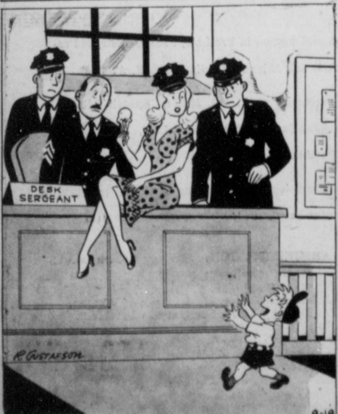
... Thank heavens you're safe, Mother!"