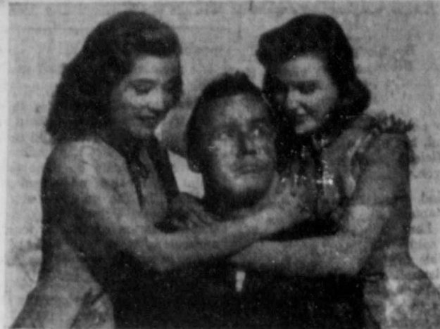
Every scene is a frolic of high spirited hilarity in "Two Girls and a Sailor" with June Allyson, Gloria DeHaven, Van Johnson and Jimmy Durante.