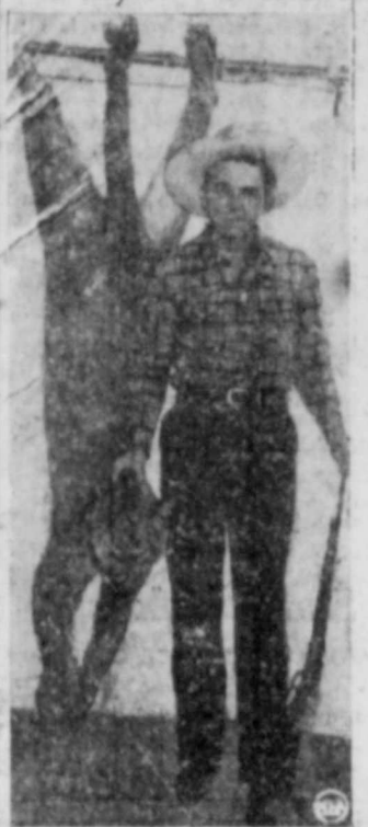
This mountain lion was preying on sheep on ranch outside Kanab, Utah, so Stuart Hamblen of motion pictures brought him down with rifle with which he has bagged 87 bears, 14 mountain lions and a snow leopard.