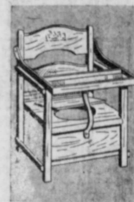
NURSERY CHAIR VALUE PRICED

Maple finished hardwood chair with wide-spread safety legs and patented release to hold baby securely. Extra large scooped "Sani-Tray." Adjustable footrest for comfort. See it!