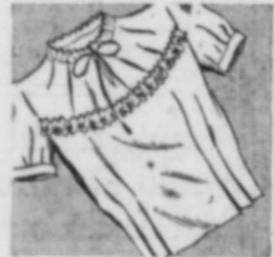
SNOW WHITE COTTON BLOUSES 1.49

These are Ward's famous Brent hats—distinctively designed and tailored with emphasis on comfort! In smart styles, good-looking summer colors.