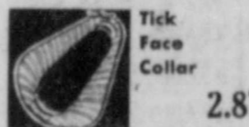
Tick Face Collar 2.87