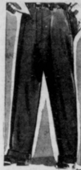
MEN'S TROUSERS OF SMOOTH GABARDINE 6.98