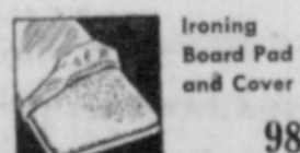
Ironing Board Pad and Cover 98c

"Supreme Quality" . . . no finer oil at ANY price! Refined from costliest crudes, triple filtered! Cut your oil bill . . . order NOW for immediate or future delivery. Limited time only!