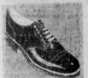
BLUCHER GRENADIERS FOR MEN 3.85