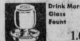
Drink More Glass Fount 1.00