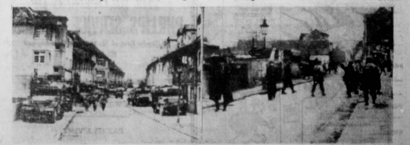
Troops and armor of the 3rd Armored division, first U. S. Army wait in a side street (pictured on right) in the city of Cologne before advancing toward the heart of the Rhine-land capital. Left photo pictures an American infantryman entering a street in Cologne while two German civilians, one carrying a white flag of surrender and another with arms raised, come out of hiding and without escort walk out of the battle area.