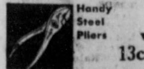
Handy Steel Pliers 1.3c