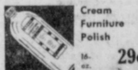
Cream Furniture Polish 29c