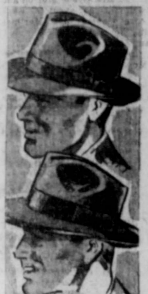
MEN'S LIGHTWEIGHT FUR FELT SUMMER HATS 4.98

60% wool, 40% rayon gabardines give these trousers a rich appearance, enduring wear in rich colors that look and actually feel cool on hot days.