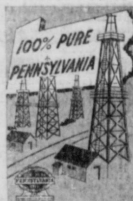
DRUM-LOT SALE OF MOTOR OIL!

Riversides are SAFER, their new carcass is 12% stronger than pre-war Riversides! Riversides are LONG WEARING: millions of them are rolling up amazing mileage! Lower priced, too!