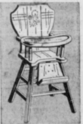
SAFE AND STURDY HIGH CHAIR