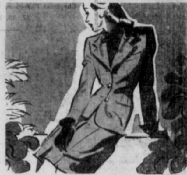
PURE WOOL SPRING SUITS IN NEW SINGING SHADES 14.98