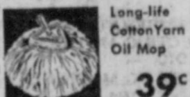
Long-life Cotton Yarn Oil Mop 39c