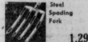
Steel Spading Fork 1.29