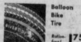
Balloon Bike Tire 1.75