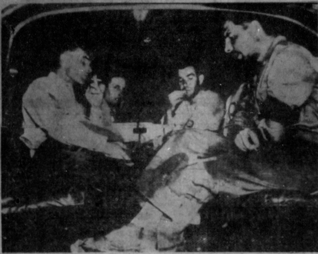
The above photo shows a group of German prisoners of war, wounded by a U.S. soldier at Salina, Utah, on their way to a hospital in an ambulance. The prisoners were sleeping when the guard went berserk and fired on them with a machine gun. Eight men were killed and 20 others injured.