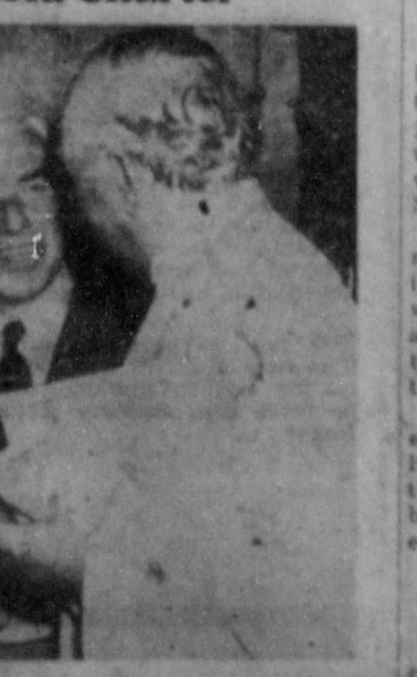
Former Secretary of State Edward Stettinius chats with Senator Arthur Vandenberg, left, and Senator Tom Connally, right, shortly before the Senate Foreign Relations committee met to officially consider the United Nations World Security Charter.