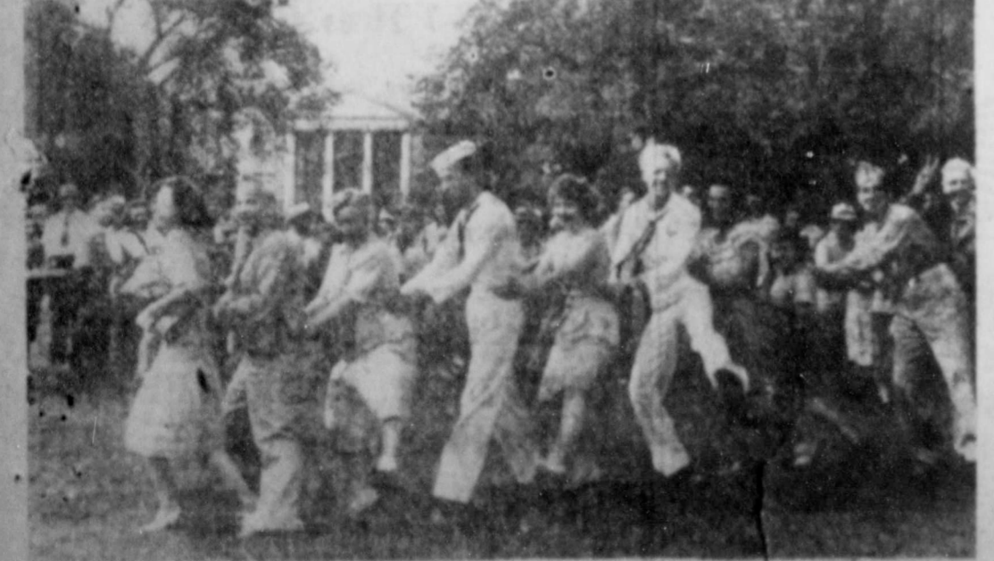
Servicemen do the Congo in front of the White House in celebration of Jap surrender.

THE WEATHER WEST TEXAS—Partly cloudy this afternoon, tonight and Friday. A few scattered thundershowers in extreme north and extreme east portions this afternoon and in the extreme east Friday.