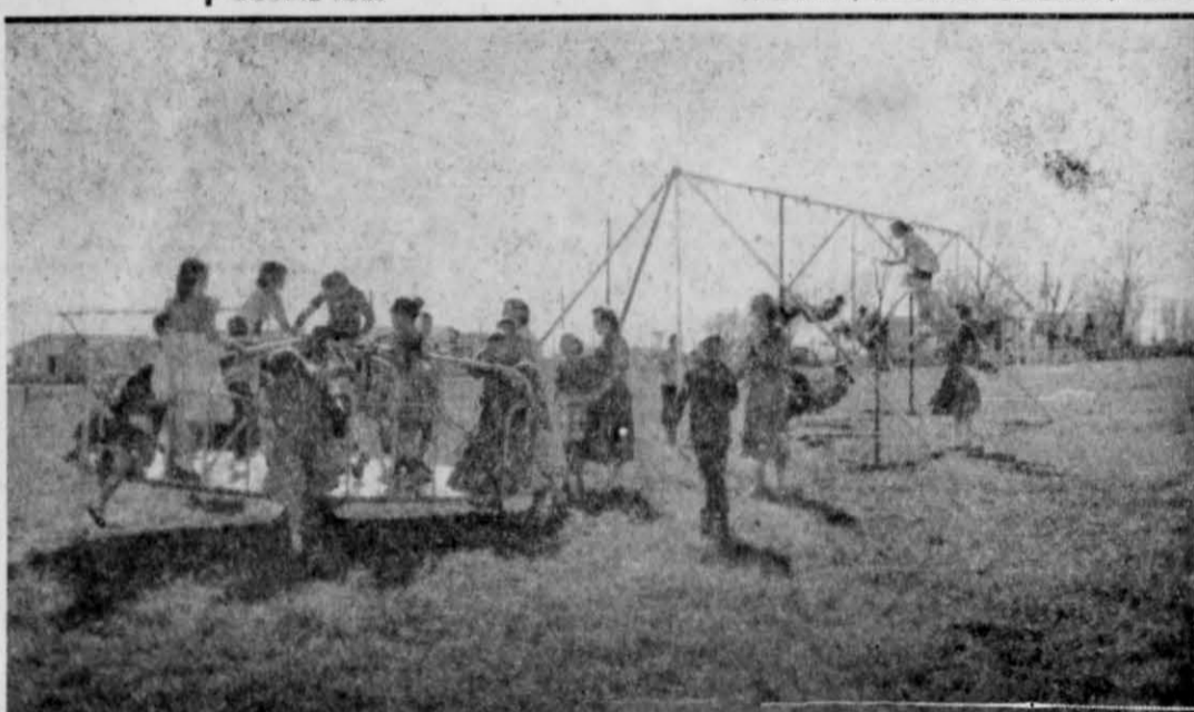
ROUND AND ROUND, BACK AND FORTH, UP AND OVER AND UNDER go these youngsters after a long day of school or pestering mother to take them to the playground. Week-end swarms of children voiced and demonstrated their approval of the new equipment recently installed at the city park. This picture was taken Tuesday following Sunday's gigantic turnout. Additional playground equipment will be on the way soon to be installed by city employees as it arrives.