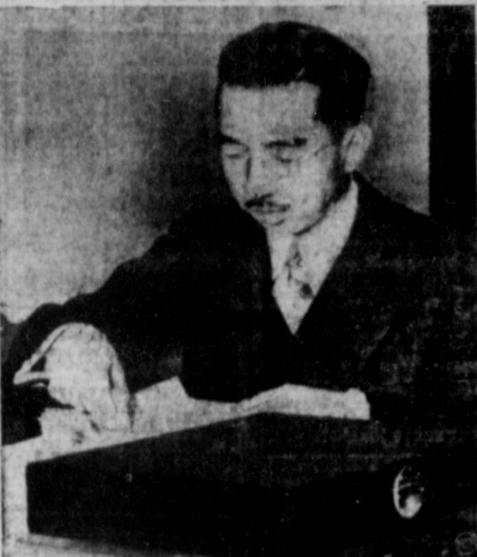
This historic photo shows Emperor Hirohito wearing a plain business suit instead of his usual military uniform, attaching his seal to more of the democratic decrees signed by General MacArthur.