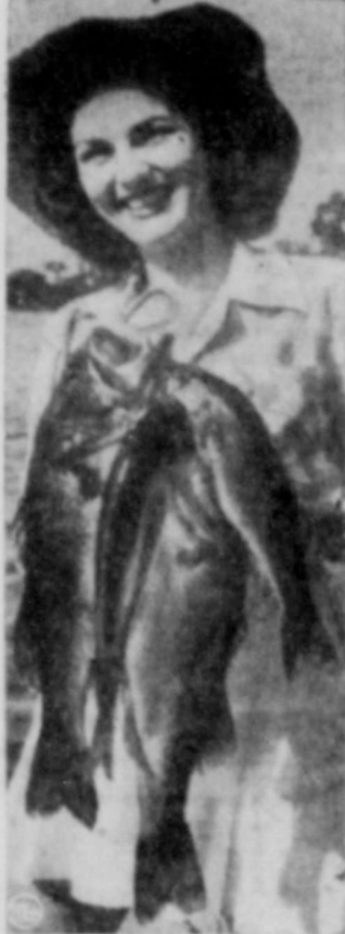
Kathleen Turner proudly exhibits string of big mouth-bass caught at Lakeland, Fla.