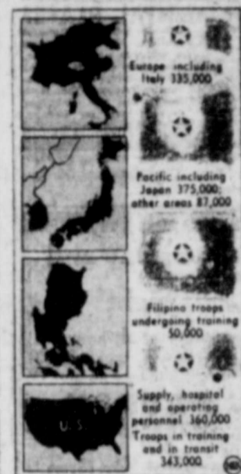
The planned strength of the U. S. Army for next July 1 is 1,350,000 men, some 400,000 less than estimates made last fall. Chart above shows how these forces will be distributed. Less than 10,000 U. S. Army troops will garrison the Philippines.