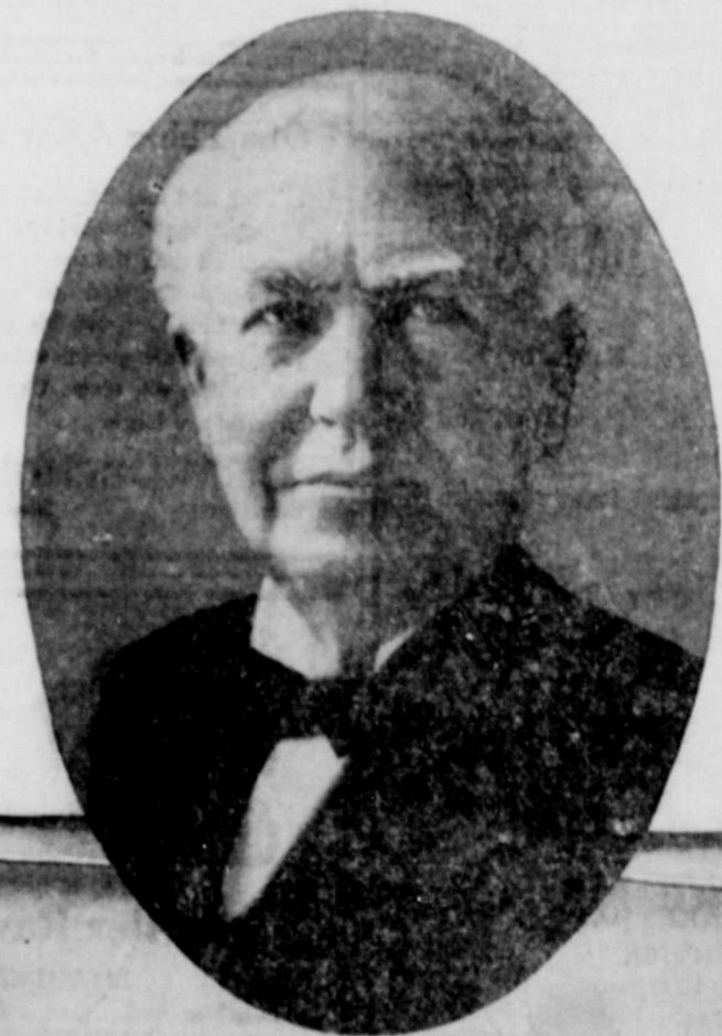
THOMAS ALVA EDISON 1847-1931

• The 100th anniversary of the birth of Thomas A. Edison is being observed throughout America to honor the memory of a man whose inventive genius has brought comfort and convenience to people throughout the world.