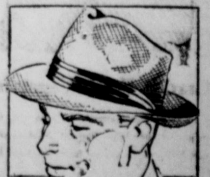
BRENT STRAW HATS

Styled for good looks! Pre-blocked styles in genuine Panama. 6% to 7%.