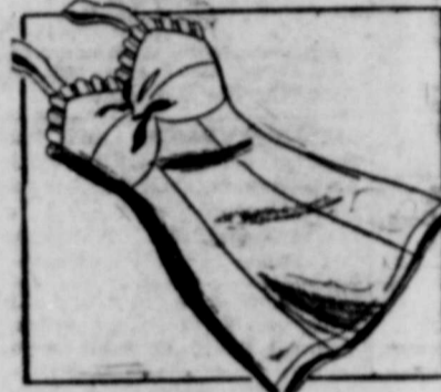
PERKY SWIM SUITS

Of Rayon Bengaline With snug-fitting cotton under-suits. Black, white, copen or maize. 32-38.