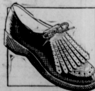
RED KILTIE OXFORD

Regularly at 3.49 Cool, washable duck with suede cloth trim. Rubber soles. Also in blue. 4-9.