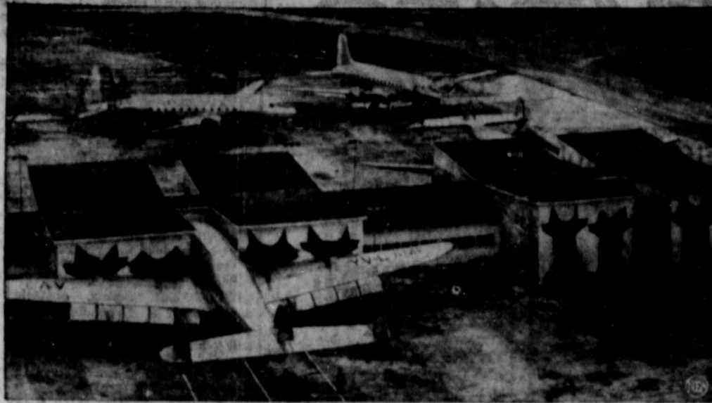
What is said to be the world's first international "service station" for maintenance and overhaul of multi-engine aircraft is pictured above, at MacArthur Field, Sayville, N. Y. Lockheed Aircraft Service, Inc., has contracted to service more than 160 transports for the U. S. military services and many domestic and foreign airlines. Planes seen in service docks belong to Venezuela's Lines Aeropostal, left, and Royal Dutch Airlines, right. In background are two transports of Argentina's Flota Aerea Mercante.

"Man, the hunter, has inflicted a terrible loss on marine mammals," he wrote in an article in a British scientific publication. "Fortunately it has not been