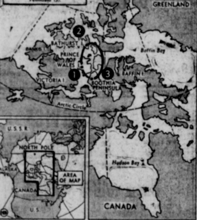
Map shows location of the three new north magnetic poles forming an ellipse shaped magnetic field recently disclosed from Air Force flights over the North Pole from Alaskan bases. The discovery is expected to prove important in trans-Arctic aerial navigation.

For many years, geographic maps showed only one magnetic north pole. But when U. S. Air Force planes invaded the Arctic on a large scale this past year they found three such poles forming an elliptical magnetic field. Major pole is on Prince of Wales Island (1), with local poles on Bathurst Island (2) and Boothia Peninsula (3).