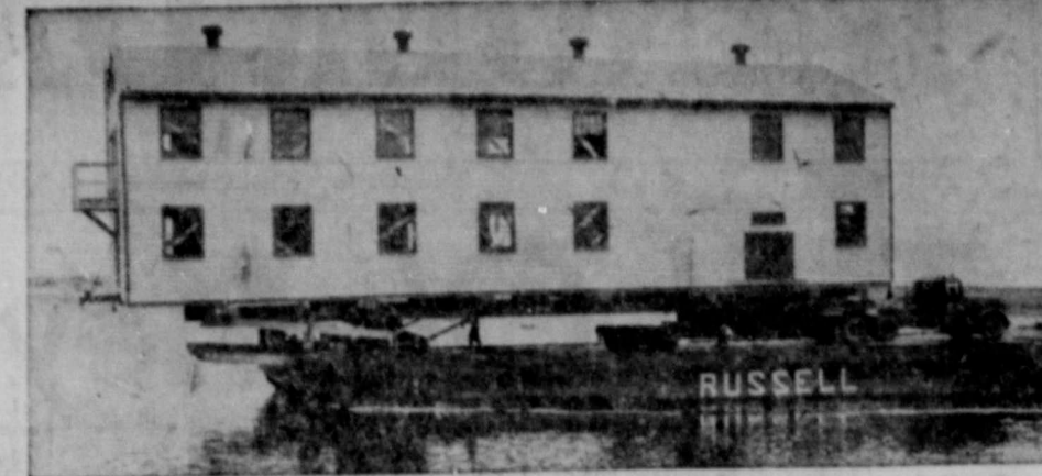
Barracks, formerly used to house atomic workers at Hanford, Wash., are being moved to Richland, 24 miles away, where a new city is springing up as the Richland Engineer Works is expanded. This building, going by truck, crosses a waterway by barge. The barracks city will eventually provide homes for 15,000 persons at Richland.

"What is needed right now is a clear, reliable report on what ammonium nitrate is. Explosive or fertilizer? Then draw up a uniform list of regulations to apply in every port."