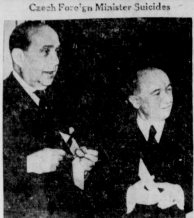
Czech Foreign Minister Jan Masaryk, 62, left, committed suicide in Prague, by leaping from a window of his home. Masaryk was one of the top diplomats under Czech President Eduard Benes, right.