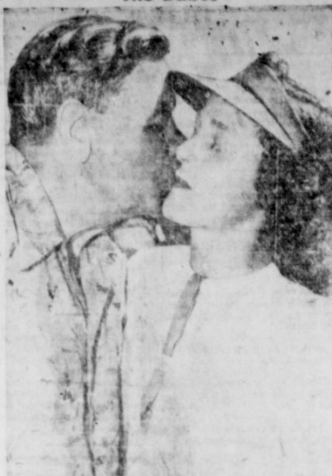
Two of the great Babes of sports get together as Babe Ruth greets Babe Didrickson Zaharias with a friendly kiss on a Coral Gables, Fla., golf course.