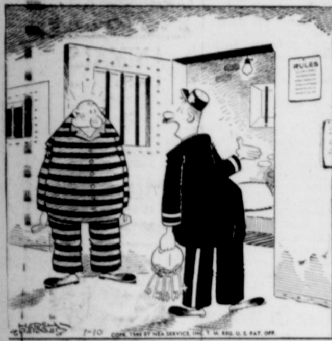
"You know the rules - no stealing, no shooting, no gambling - make yourself right at home!"