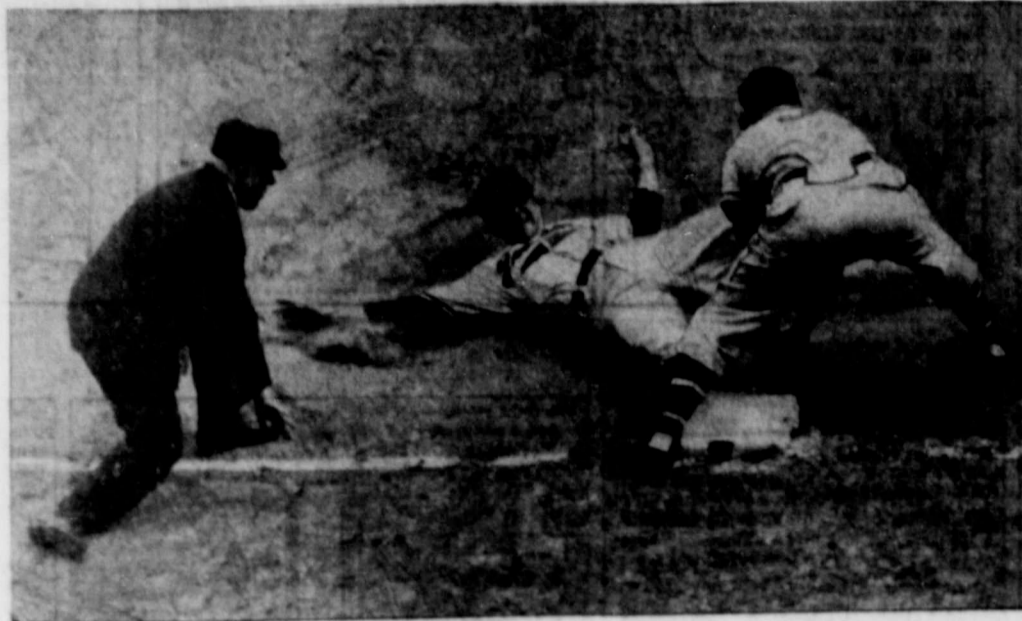
Graves third baseman Bob Elliott puts the ball on Lou Boudreau, as the Indians manager was out trying to stretch his first inn game in the fourth game of the World Series in Cleveland Stadium. Umpire Bill Stewart calls Boudreau out, starting an argument with Boudreau and Indians coach Bill McKechnie.