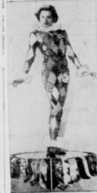
Jane Greer, screen actress, has been chosen "Miss Valen-tie of 1948," which explains her get-up. It's a patchwork of neckties. The Men's Tie Foundation picked her to reign over their New York convention.

Baylor and then managed only a tie against the Aggies the rest of the way in.