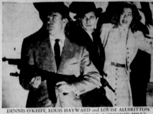
DENNIS O'KEEFE, LOUIS HAYWARD and LOUISE ALBRITTON await developments in Columbia's "WALK A CROOKED MILE."

All American Football Conference defiantly assured the rival National League today that it would stay in business next season with all of its eight clubs, but left the way open for a peace move between the warring pro loops.