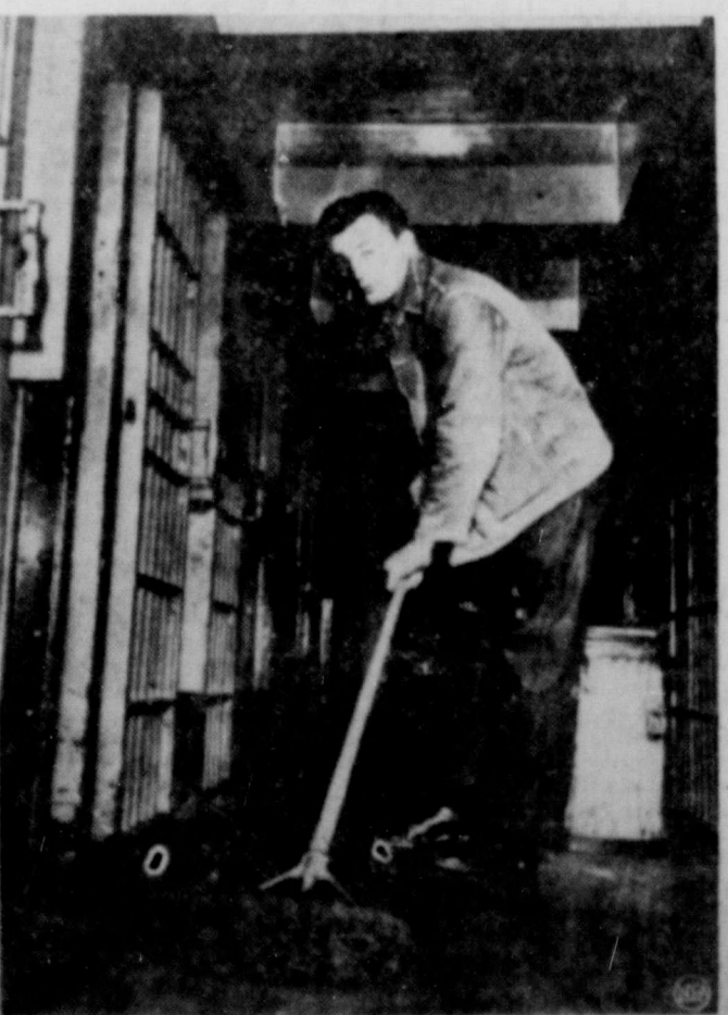
Screen Actor Robert Mitchum, sentenced to 60 days in Los Angeles County jail on marijuana charges, started the first day of his sentence by mopping the cell-block corridors.