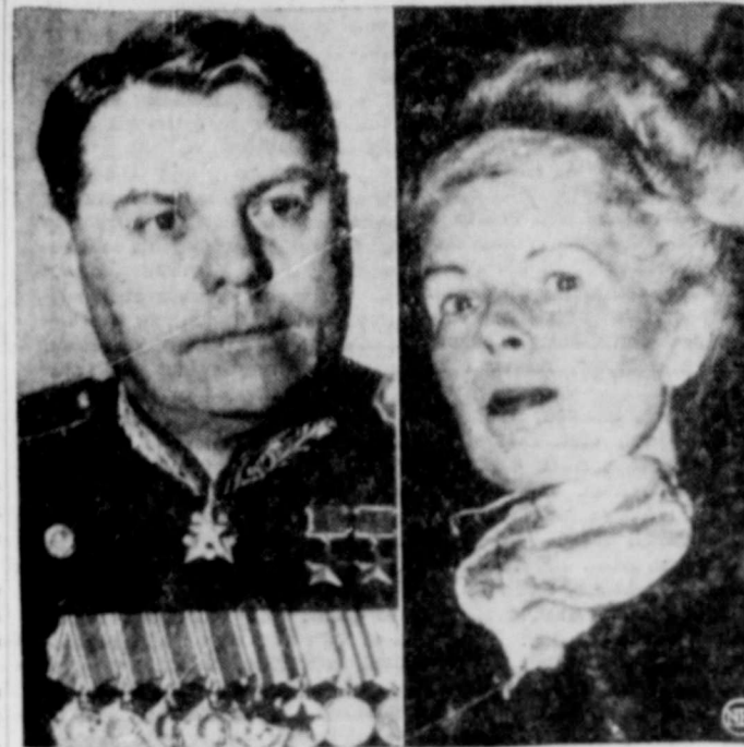
Marshal Alexander M. Vassilevsky, left, Vice-Minister of the Russian Armed Forces, is slated to fill the vacated post of Marshal Nikolai Bulgannin, the Minister of the Armed Forces. At right, Mildred, Axis Sally, Gillars leaves Federal Court in Washington after being sentenced to serve from 10 to 30 years for treason and a $10,000 fine.