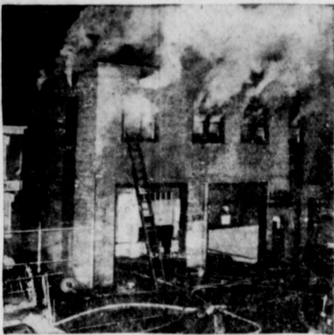
Smoke pours from the windows and vents of the Hygrade Bakery in West Philadelphia, as a four-alarm fire rages out of control through the plant, which specializes in the manufacture of pretzels and potato chips. The flames, which swept to an adjoining paint factory, caused damage estimated at $300,000.